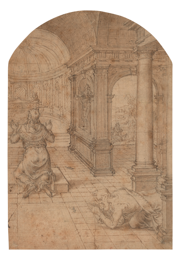
Fig. 20 WOUTER CRABETH, The Pharisee and the Innkeeper, c. 1565-70. Black chalk, pen and

brush and brown ink, 312 x 215 mm. Brussels, private collection.