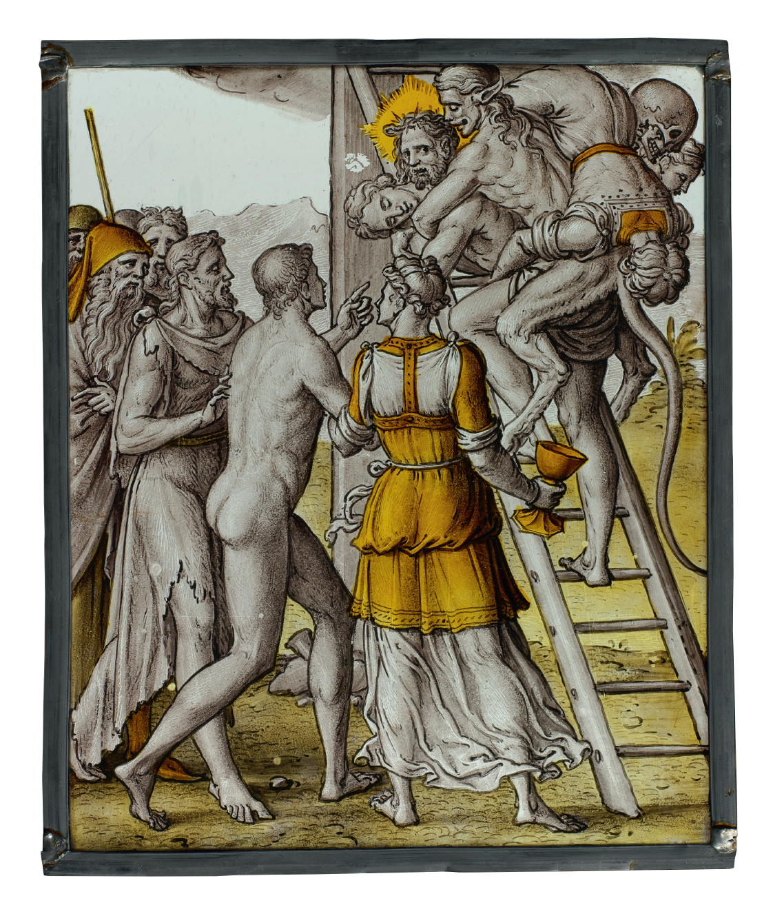
Fig. 12 DIRCK CRABETH, Christ as the Saviour of Man Reborn, c. 1545-50. Grisaille and silver yellow on clear glass, 25 x 20.5 cm. Amsterdam, Rijksmuseum, inv. no. BK-1984-45.

The last episode, the drawing in Paris, Fondation Custodia (F. Lugt Collection), Institut Néerlandais, The Fight of New Man against the Forces of Evil , brings together the beginning and the end: the old Adam and the new