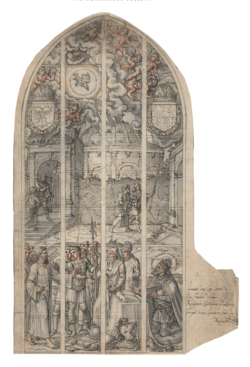
Fig. 16 DIRCK CRABETH, Christ and the Tribute Money with Emperor Charles v, 1543-49. Pen and black ink, grey and red wash, 371 x 178 mm. Amsterdam, Rijksmuseum, inv. no. RP-T-1937-13.

In Dirck's later works, starting with his first Gouda window in 1555, the compact figure style gives way to more elongated figures, which justifies the early dating of the Road to Salvation cycle to the period 1545-50. Another characteristic also points to this dating. Dirck Crabeth often used Latin inscriptions in his monumental stained glass. In the designs/corresponding panels of the story of St Paul and the Road to Salvation, however, we find the only examples of integrated texts in panels,