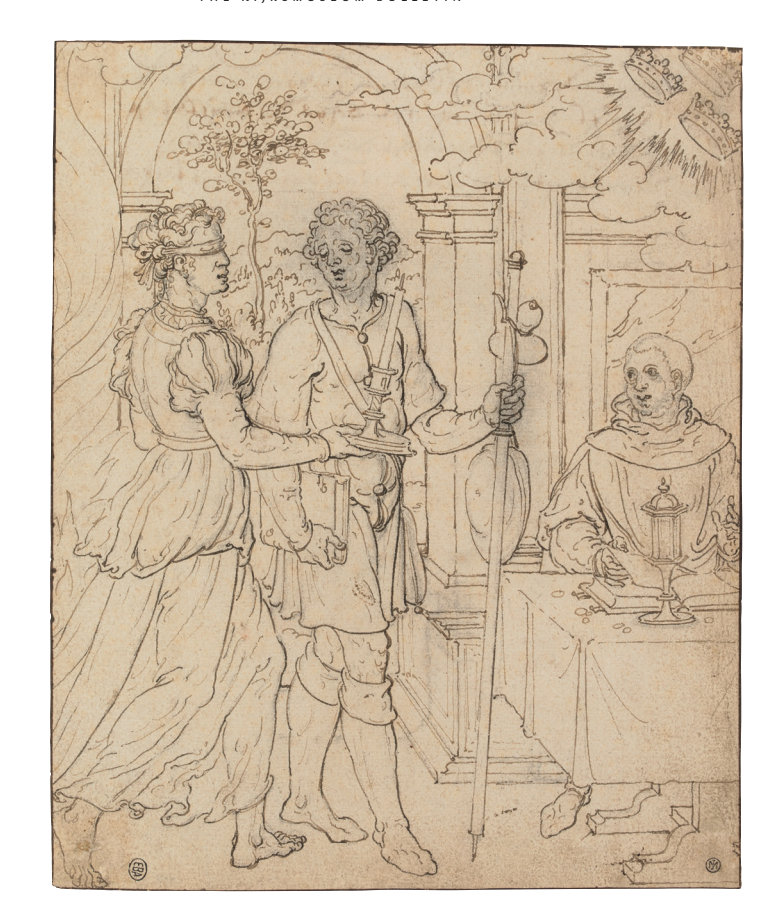
Fig. 5 DIRCK CRABETH, Man as a Pilgrim between Ingenuity and Good Works, c. 1545-50. Pen and brown ink over black chalk. 236 x 191 mm. Paris, École nationale supérieure des Beaux-Arts, inv. no. мб99.

Protestant propaganda images, John the Baptist is the one who introduces the new (and proper) faith to reborn Man, and that Moses is the representative of the old law (which does not work). This assertion is absolutely correct. John the Baptist will indeed get the chance to show Man the right path, but not until the penultimate, seventh episode, where he has pushed Moses into the background (fig. 11). In the second episode Man is still the old Adam, with a garland of leaves around his loins, and he still has to pass through different stages in search of his salvation. The pointing figure is not wearing a garment of camel's hair like John the Baptist, and in terms of type, clothing, the text of the quatrain and the parallels with the print series he must represent Moses. Nevertheless, the book instead of the tablets of the law, and the sword