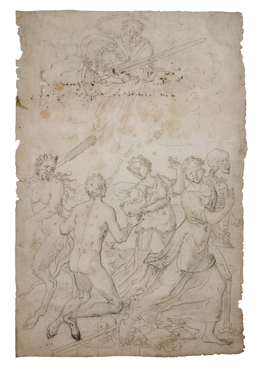
Fig. 10 Workshop of DIRCK CRABETH WOUTER CRABETH, Reborn Man is Handed the Christian Armour by God, с. 1550-60. Pen and dark brown ink over black chalk: some outlines touched up in dark grey ink, brown and grey wash, 325 x 216 mm. Utrecht, Museum Catharijneconvent, inv. no. ABM te29.

verso as well as the Latin inscriptions on the recto.<sup>26</sup> Man is reborn and receives from God 'the shield of faith, the helmet of salvation and the sword of the spirit', attributes of the Christian warrior.<sup>27</sup> Immediately Despair, Blind Ingenuity and Death flee from him, like the graceful woman in the centre. According to the quatrain she is 'innate ability', Man's (earlier) conviction to perform good works in order to obtain salvation of his soul.