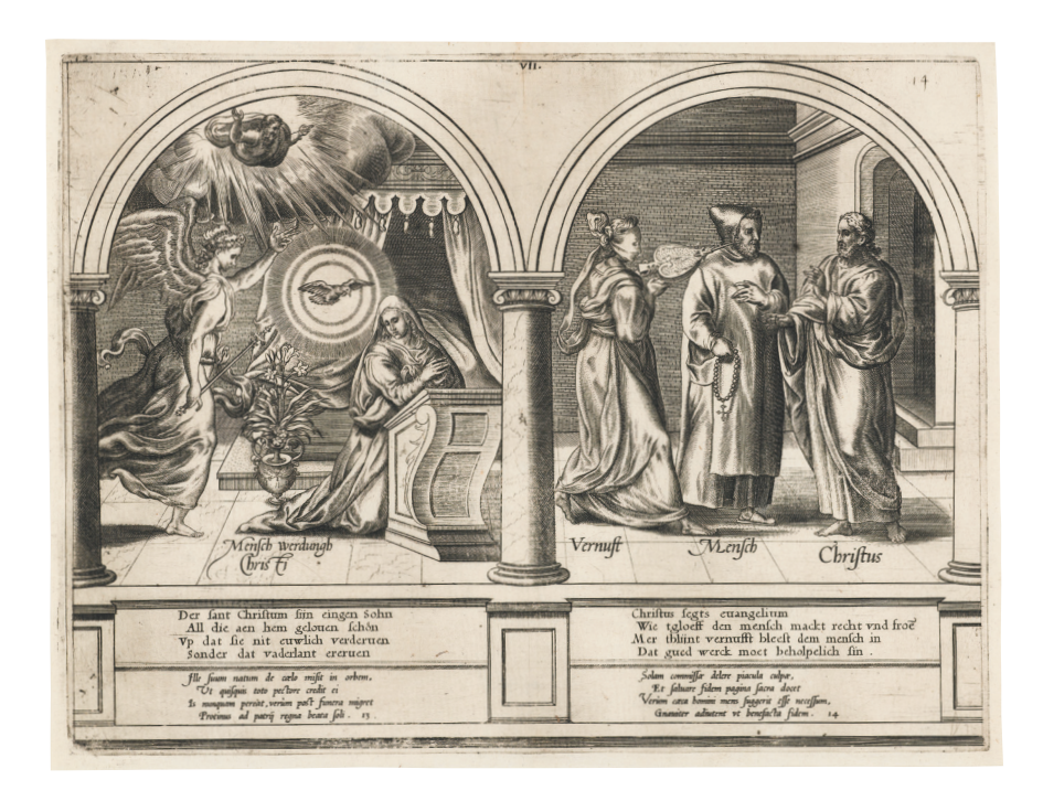
Fig. 17 FRANS HUYS after GERARD VAN GROENINGEN, Annunciation/ Man between Ingenuity and Christ, from the series The Road to the Salvation of Man, c. 1560. Engraving, 275 x 362 mm. Amsterdam, Rijksmuseum, inv. no. RP-P-1989-168.

drawings in Utrecht was copied, the old attribution to one of the artist's assistants can be reinstated. 47 Like the originals, the copies are pen-and-ink drawings over black chalk, now with some wash for the shadow passages. Compared to the original, their style is far more Mannerist, which is particularly obvious in the two versions of Moses Points Sinful Man to Hell (figs. 3, 4). The squat proportions of the two figures in the foreground of Dirck's design are lengthened and Moses's slim legs show through his long, thin tunic much more clearly. The copyist remained true to the original down to the tiniest details, like the hands and the feet, but with subtle alterations. For example, the left hand of the old Adam in Dirck Crabeth's drawing, which corresponds exactly to Saul's left hand (figs. 1, 14), was given somewhat longer, slim fingers in the Utrecht copy. Aside from the materials used and the figure style, the drawing technique is also different. Crabeth's characteristic short, arch-like dashes he used to articulate the faces and