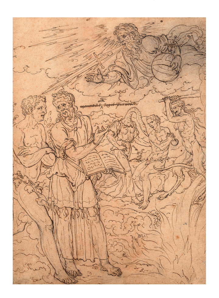
Fig. 3 DIRCK CRABETH, Moses Points Sinful Man to Hell, c. 1545-50. Pen and brown ink, 246 x 177 mm. Netherlands, private collection.

The second drawing is Moses Points the Sinful Man to Hell (fig. 3). Man from the previous episode, wearing a wreath of fig leaves around his loins, is tormented in the background by a female figure with a snake's head and a demon with a club. In translation.