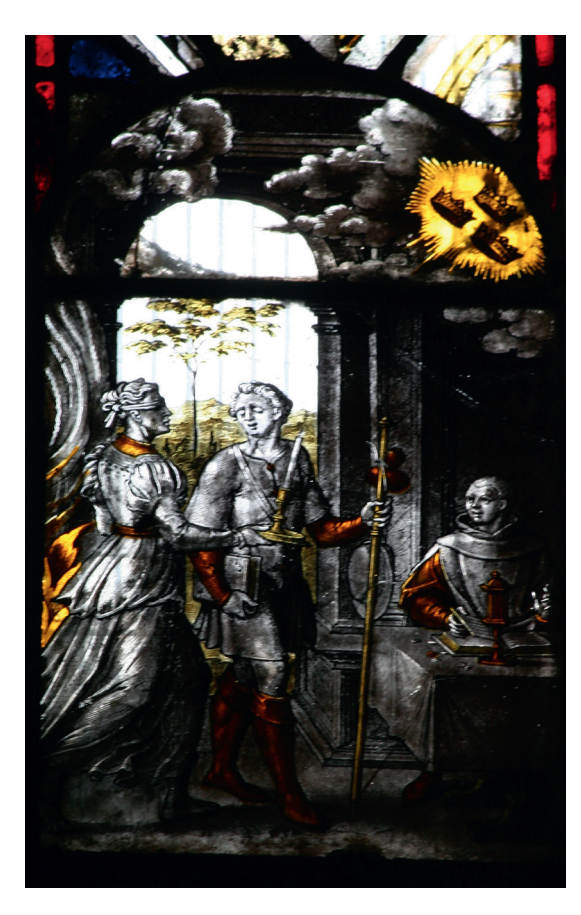
Fig. 6 DIRCK CRABETH, Man as a Pilgrim between Ingenuity and Good Works, c. 1545-50. Grisaille, silver yellow and sanguine on clear glass, 32 x 19.5 cm. Shrewsbury, Shropshire, Church of St Mary, east window of the north porch.

Fig. 7 DIRCK CRABETH, Man between Ingenuity and Christ, c. 1545-50. Pen and brown ink over black chalk, 236 x 191 mm. Paris, École nationale supérieure des Beaux-Arts, inv. no. M698.