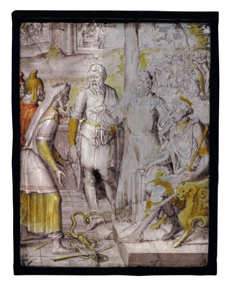
Fig. 22 WOUTER CRABETH, Moses before the Pharaoh, c. 1560. Grisaille and silver yellow on clear glass, 25 x 20 cm. Cholmondeley, Cheshire, Cholmondeley Castle Chapel.

scenes do not lend themselves well to comparison. This is due not only to the meticulous finishing touches in pen and brush, but also to the refined composition with Renaissance architecture, partly influenced by the three Gouda windows to a design by Lambert van Noort (c. 1520-1570/71). It is only the swift drawing of the background, the mountain landscape and the tree with short strokes in pen in The Pharisee and the Innkeeper that show some similarity to one of the sheets in Utrecht (figs. 20, 8). Wouter Crabeth would go on to use the typical kneeling pose of reborn Man (fig. 10) again, not only for the Pharisee, but for the high priest in his stained-glass window with Heliodorus (1566) in the Church of St John in Gouda.