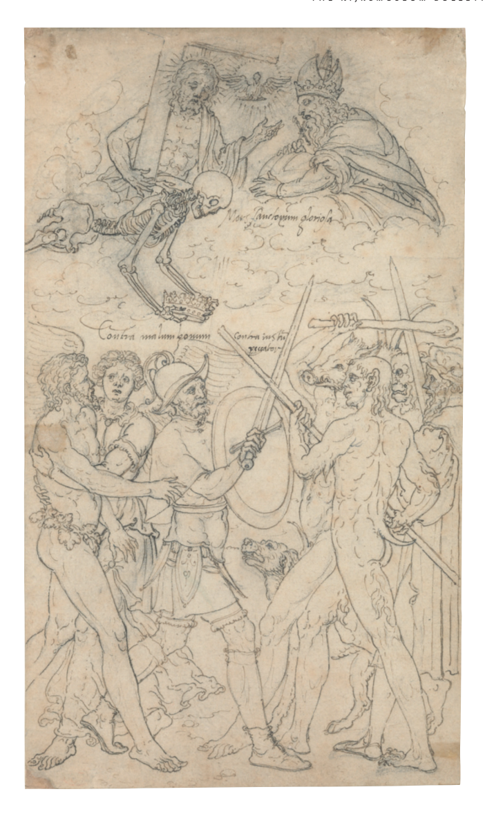
Fig. 13 DIRCK CRABETH, The Fight of New Man against the Forces of Evil, c. 1545-50. Pen and brown ink over black chalk, 335 x 194 mm. Paris, Fondation Custodia (F. Lugt Collection), Institut Néerlandais, inv. no. 3950.

Man (fig. 13).<sup>33</sup> In the meantime the latter has been dressed as a Christian warrior and crosses swords with the Devil, all kinds of monsters and a false prophet on the right. The old Adam tries to intervene but he is held back by Faith. Immediately above the action are the words 'Good is set against evil, and so also is the sinner against a just man.' <sup>34</sup> Christ the Saviour with the cross on his shoulder, God the Father and the Holy Ghost look down from heaven, while Death hands a crown to the