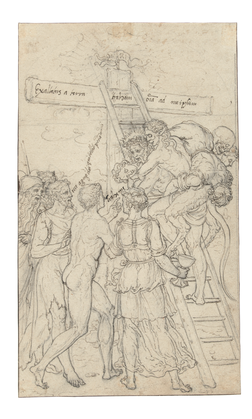
Fig. 11 DIRCK CRABETH, Christ as the Saviour of Man Reborn, c. 1545-50. Pen and brown ink over black chalk, 322 x 190 mm. Amsterdam, Rijksmuseum, inv. no. RP-T-1960-175.

world.'<sup>29</sup> On the cross are the words of Christ: 'And I, if I am lifted up from the earth, will draw all peoples to Myself,' whereupon Man replies: 'take me.'<sup>30</sup> Christ ascends the cross with the Devil, Death, a naked man and two women who cannot be further identified on his back. They may represent personifications of various sins.