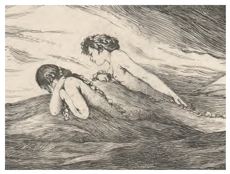
Detail of RP-P-2020-86