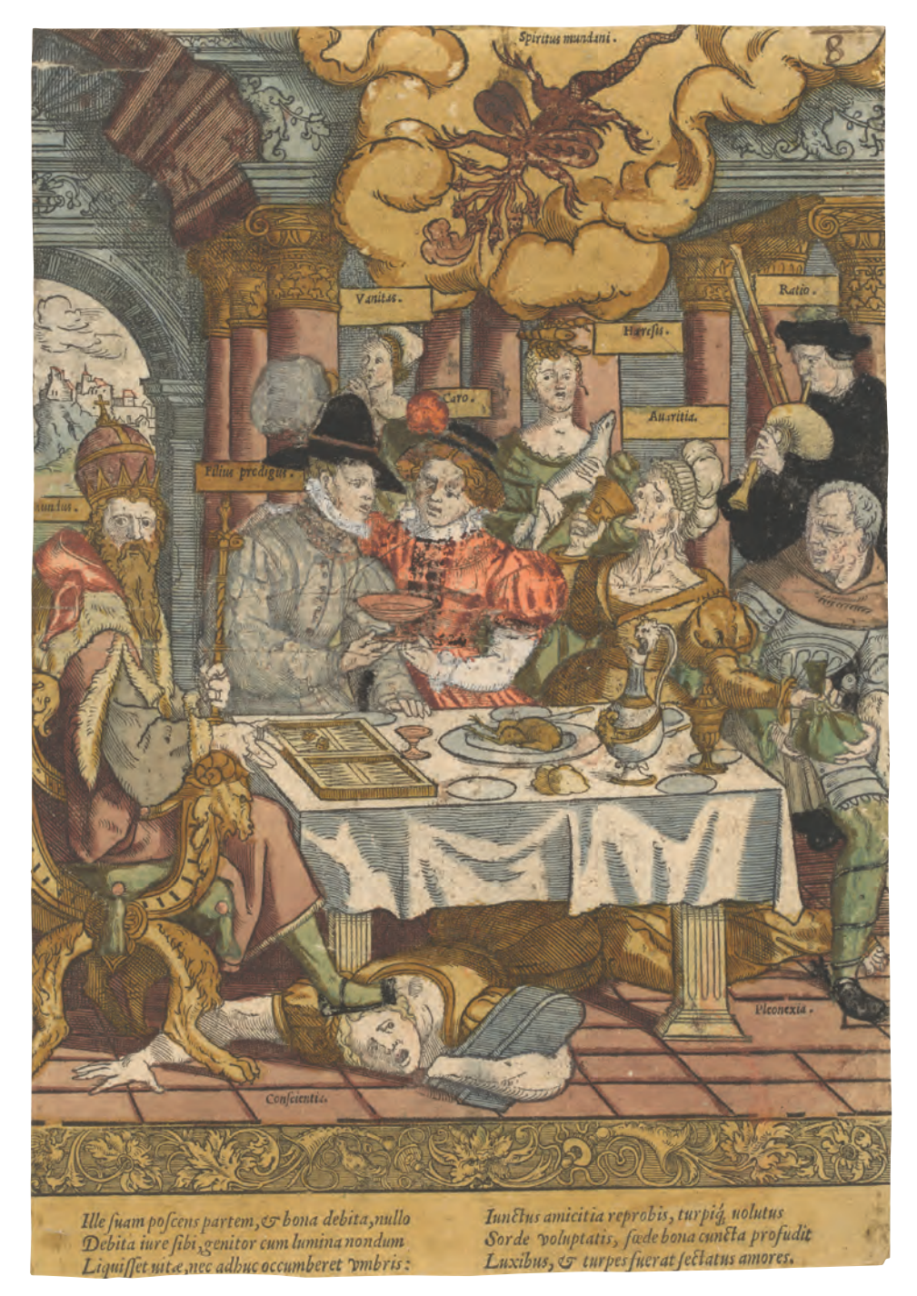
Aquisition 2.2 (RP-P-2019-21)