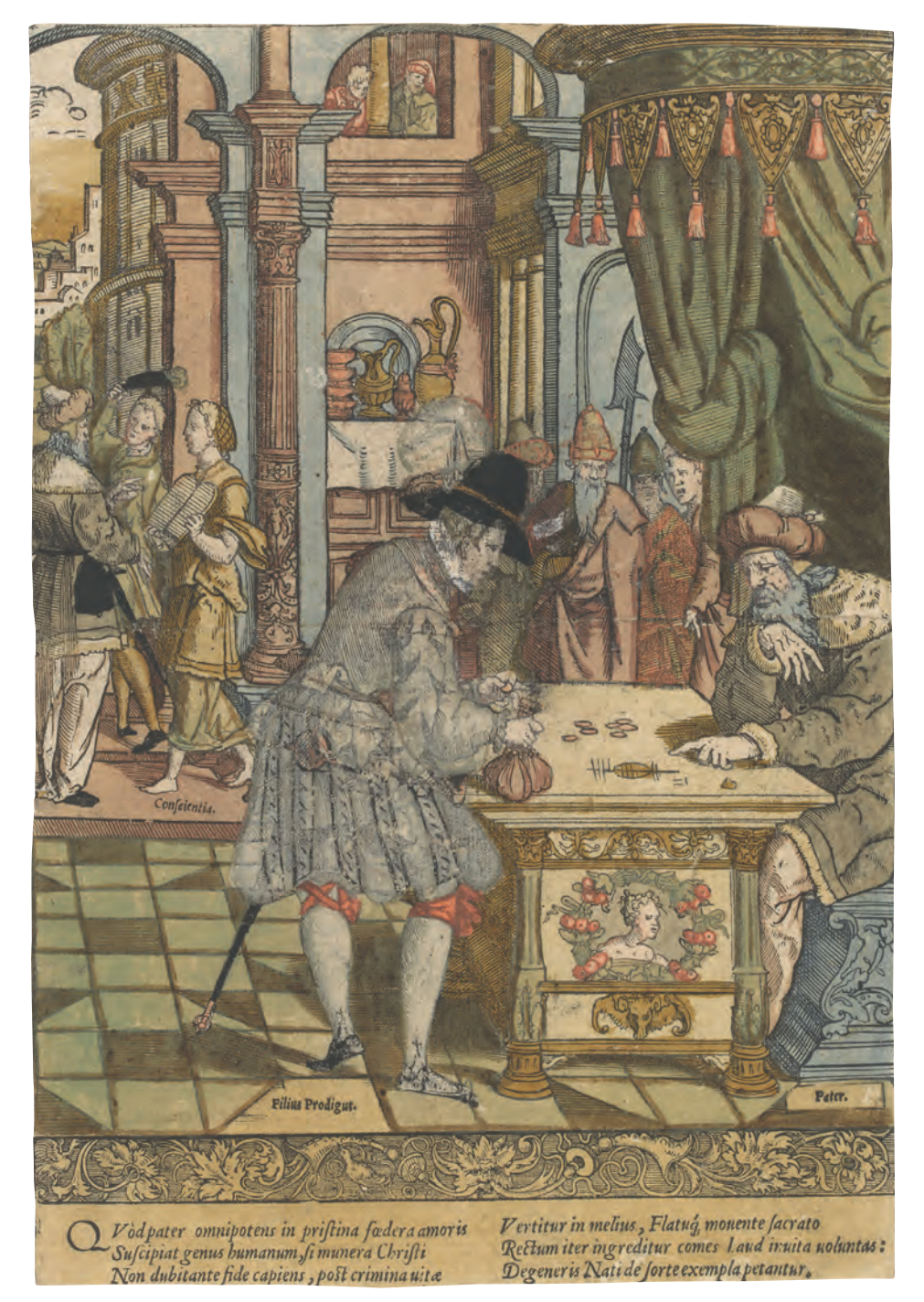
Aquisition 2.1 (RP-P-2019-20)