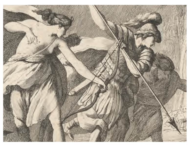
Detail of RP-P-2020-87