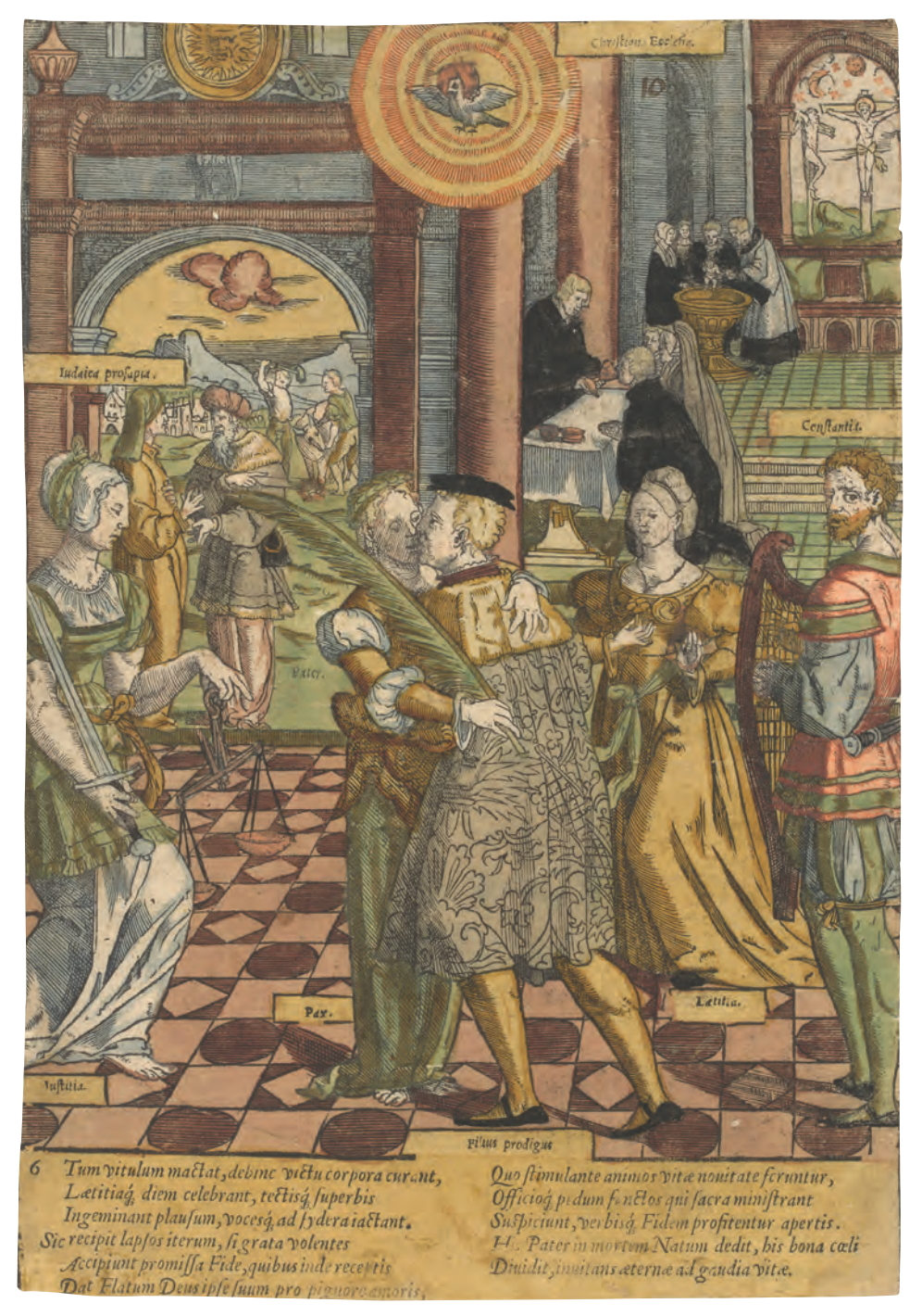
Aquisition 2.6 (RP-P-2019-25)