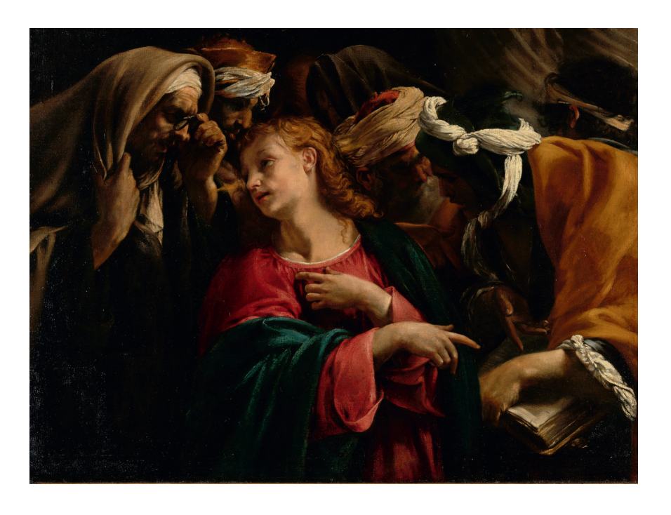
Fig. 4 ORAZIO BORGIANNI, Christ among the Doctors, c. 1609. Oil on canvas, 78.2 x 104.6 cm. Amsterdam, Rijksmuseum; inv. no. SK-C-1709; on loan from the Broere Charitable Foundation, 2012.