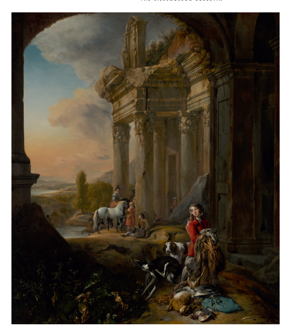
Fig. 7 JAN BAPTIST WEENIX, After the Hunt, c. 1656. Oil on panel, 87 x 75 cm. Amsterdam, Rijksmuseum, inv. no. sk-c-1786; on loan from the Broere Charitable Foundation, 2017.

> Fig. 9 DIRK VALKENBURG, A Eurasian EagleOwl with Other Birds in a Landscape, c. 1695-1700. Oil on canvas, 127 x 101 cm. Amsterdam, Rijksmuseum, inv. no. sk-c-1821; on loan from the Broere Charitable Foundation, 2021.