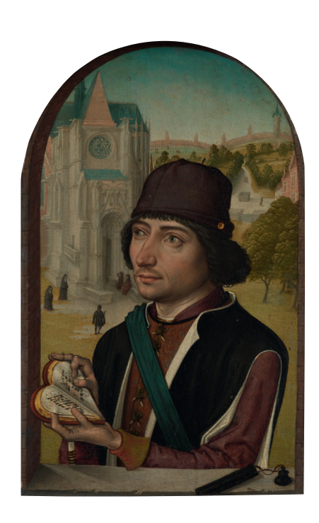
Fig. 19 MASTER OF THE VIEW OF SAINT GUDULA, Portrait of a Young Man, c. 1480-85. Oil on panel, 22.8 x 14 cm. London, National Gallery, inv. no. NG2612; Salting Bequest, 2010.

The painting was not one of the sixty-five works purchased by Louis Bonaparte, King of Holland, for the Koninklijk Museum two hundred years ago, but now, thanks to the Broere Charitable Foundation, it has been reunited with these works in the Rijksmuseum.