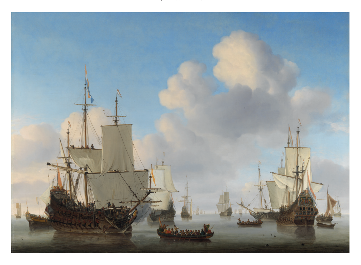
Fig. 14 WILLEM VAN DE VELDE, Dutch Ships in a Calm Sea, c. 1665. Oil on canvas, 86.8 x 120 cm. Amsterdam, Rijksmuseum, inv. no. 5K-C-1707; on loan from the Broere Charitable Foundation, 2012.

he shows a small Dutch squadron preparing to set sail. The stern of the ship in the foreground on the right is decorated with the arms of Amsterdam, held up by two lions rampant. The crossed anchors of the admiralty are at the bottom on the stern to the right of the rudder.