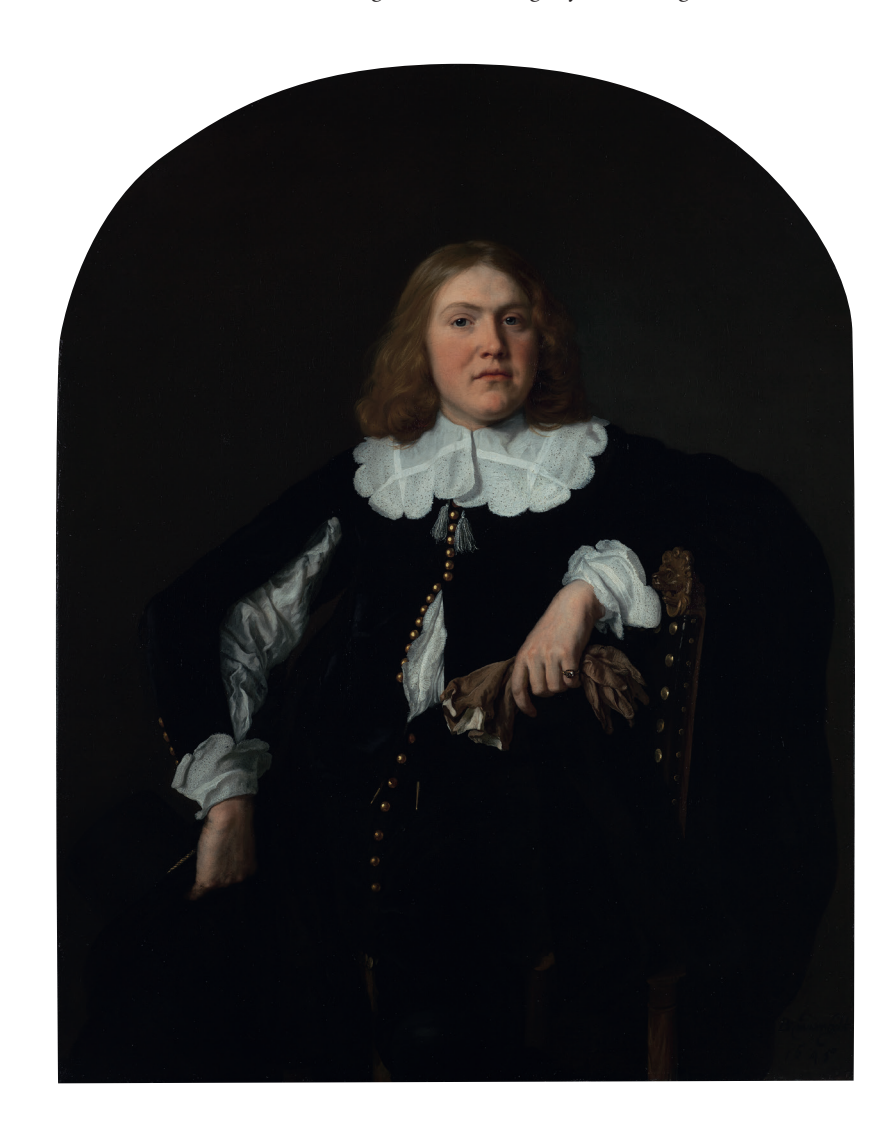
Fig. 16 BARTHOLOMEUS VAN DER HELST, Portrait of a Gentleman, 1645. Oil on canvas, 129.4 x 101.3 cm. Amsterdam, Rijksmuseum, inv. no. sk-c-1826; on loan from the Broere Charitable Foundation, 2021.

Van der Helst's talent for expressing surface and texture is unmistakable in the details. The white of the shirt, the lace-trimmed collar and the decorative cuffs lend the young man's clothes lively definition and contrast. The man actively addresses the viewer. While he leans back leisurely with one arm on the back of the chair, his gloves held casually in his hand, his other hand, holding his hat, rests lightly on his thigh.