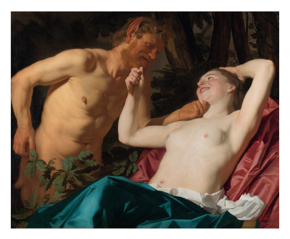
Fig. 3 GERARD VAN HONTHORST, Satyr and Nymph, 1623. Oil on canvas, 104 x 131 cm. Amsterdam Rijksmuseum, inv. no. SK-C-1759; on loan from the Broere Charitable Foundation, 2015.