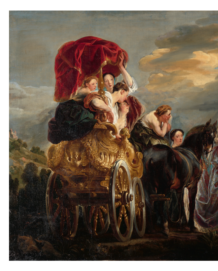
Fig. 13 JACOB JORDAENS, The Meeting of Odysseus and Nausicaa, c. 1630-35. Watercolour and probably tempera over an underdrawing in black chalk on paper, 96.2 x 193.6 cm. Private collection.

Fig. 12 JACOB JORDAENS, The Meeting of Odysseus and Nausicaa, c. 1635-40. Oil on canvas, 117.5 x 194 cm. Amsterdam, Rijksmuseum, inv. no. sK-C-1744; on loan from the Broere Charitable Foundation, 2013.