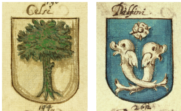
Figs. 21a, b Arms of the Celsi and Delfini, from Stemmi gentilizi delle più illustri famiglie romane , 17th century. Rome, Biblioteca Casanatense, ms. 4006, unpagged, nos. 194, 262.

In attempting to come to a synoptic assessment of these lockplates as a historical phenomenon, the hypothesis proposed by Bertrand Bergbauer – that the group as a whole is a product of a nineteenth-century campaign of forgery – must first be rebutted. While there are proven examples of forgeries, these are recognizable as such, as in the case of the series of copies that imitate the lockplate in the Museum of Art in Dallas and consistently display the same coat of arms. 42 However, on the grounds of the complex heraldic connections with specific historical personages that they display, it should be concluded that the majority of the lockplates are without doubt genuine.