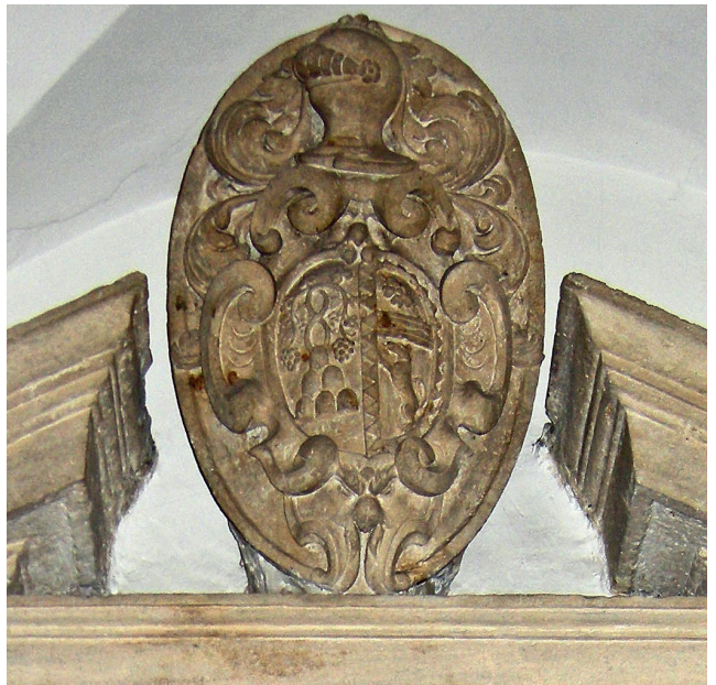
Fig. 16 Impaled arms of Orazio Ruspoli and Felice de' Cavalieri on the portal to the piano nobile of the former house of Orazio Ruspoli, c./after 1594. Rome, 25 Via dei Banchi Vecchi.

However, the hasp of the Rijksmuseum lockplate displays an additional coat of arms that surprisingly can be assigned neither to the kinship of the Ruspoli nor to that of the