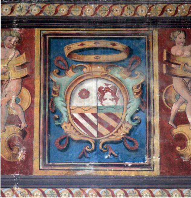
Fig. 13 Impaled arms of Enrico Orsini and Diana Savelli, c. 1570. Stimigliano, Palazzo Orsini, piano nobile .