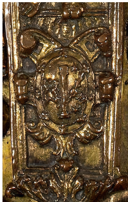
Fig. 7a Lockplate of Pirro Frangipani and Flaminia Armentieri, before 1480. Gilt bronze, plate: 18 x 18 cm. Sale, London (Bonhams), 5 July 2012, no. 1.