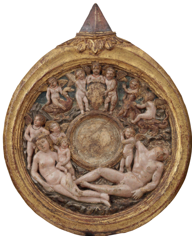
Fig. 3 ANTONIO POLLAIUOLO, Mirror frame in the form of a Medici ring, c. 1470–80. Painted and gilt stucco in a gilt wood frame, h. 64.2 x w. 50.8 x d. 5.5 cm. London, Victoria and Albert Museum, inv. no. 5887-1859.