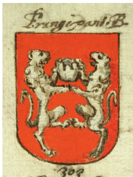
Figs. 8a-c Coats of arms of the Frangipani, Colonna and Armentieri, from Stemmi gentilizi delle più illustri famiglie romane, 17th century. Rome, Biblioteca Casanatense, ms. 4006, unpagged, nos. 303, 121, 824.

(figs. 8a-c). Arms of alliance on the hasp also embellish the lockplate of Marcantonio III Colonna and Felice Orsina Peretti (marr. 1589), the great-niece of Pope Sixtus V and sister of Cardinal Montalto, 20 also that of Flaminio Delfini, Roman officer and later commander of the papal fleet, and Maria Ridolfi (marr. 1593), 21 and that of the Roman banker and art