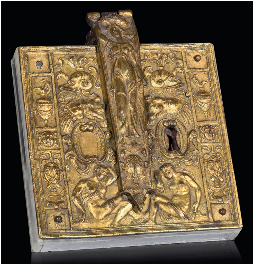
Fig. 20 Lockplate of Celso Celsi and Virginia Delfini, c./after 1572. Gilt bronze, plate: 18 x 18 cm. Sale, Vercelli (Meeting Art), 17 November 2019, no. 200.

It is doubtful whether elaborate chests like that for their sister were acquired for Virginia and Flaminio Delfini. Since the Lancellotti/Delfini chests are among the very latest examples of lavishly decorated marriage chests, the discrepancy between the types of chest would seem rather to be a symptom of the general disappearance of these kinds of elaborate matrimonial chest, which in Tuscany had already long lost their role and ceremonial function. The change to the travelling chests that had recently come onto the market was presumably based on a new pragmatism that valued universal utility.