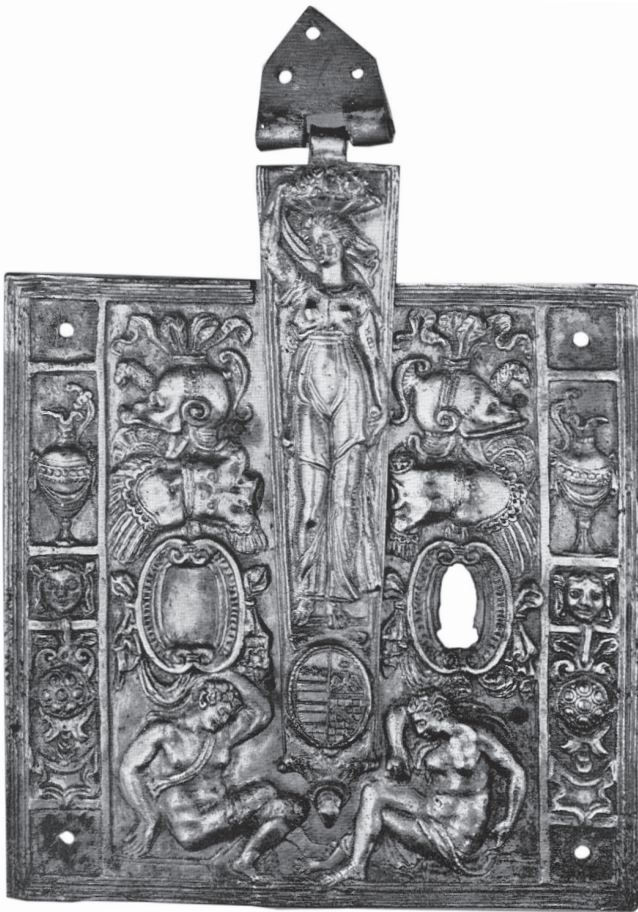
Fig. 9 Lockplate of Lelio Cevoli and Giulia Mattei, c./after 1596. Gilt bronze, plate: 18 x 18 cm. Sale, Hanover (Zietz), 1975, no. 72. Research Institute, https://archive.org/details/utriusque-cosmimaoflud/page/n12/mode/1up .

A total of five lockplates can be assigned to the ancient Roman family of the Orsini. At least three of these display a heraldic alliance with the Savelli family, with whom the Orsini frequently contracted marriages. 27 The most eloquent of these displays the alliance in dual form: on the lockplate in the Museum of Fine Arts in Boston the impaled arms appear on the hasp, with the arms of the Orsini additionally on the (male) right-hand cartouche, and the arms of the Savelli on the (female) left-hand cartouche (fig. 11). This unique and exceptional case of double arms of alliance evidently points to an alliance between the Orsini and Savelli families over two generations and can duly be assigned unequivocally: in the second half of the sixteenth century there was only one double alliance of this kind: Franciotto Orsini, son of Enrico, Marquese di Stimigliano (fig. 13), from the Orsini-Monterotondo branch of the family, married Camilla Savelli before 1589. His father Enrico Orsini had taken as his second wife Camilla's cousin Diana Savelli. As Franciotto was the result of an earlier (illegitimate) union of Enrico's, one could assume that the Marquese di Stimigliano gave the lockplate as a gift to his only son and the latter's wife in order to insinuate genealogical continuity and legitimacy via the arms of two generations. 28