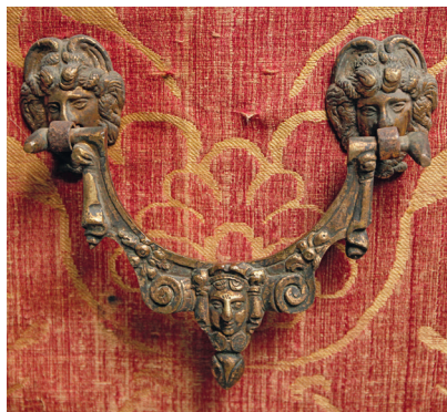
Fig. 5 Detail showing the side handle of the chest (fig. 4).

many examples have survived, while hardly any of their original supports, that is to say the chests for which they are supposed to have been intended, have. 10 This is indeed a remarkable circumstance. Nonetheless, a couple of original sets of chests with their lockplates have survived, together with their matching lateral bronze handles (figs. 4, 5). 11 These examples reveal the reason why almost all the locks were detached from the chests over the course of time. These wooden chests were relatively simple pieces of furniture whose construction with barrel-vaulted lids was widespread for