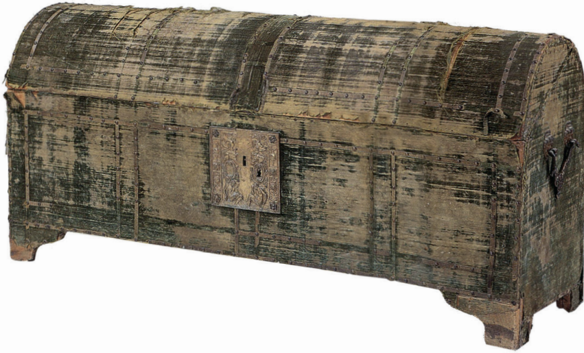
Fig. 4 Chests with lockplate and original handles, c. 1590. Poplar wood, with velvet and silk covering, h. 61 x w. 135 x d. 46 cm and h. 60 x w. 134 x d. 45 cm. Sale, Paris (Etude Tajan), 17 May 2000, no. 39 and private collection (the latter with later covering).