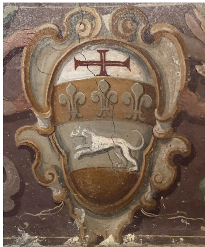
Fig. 17 Detail with the coat of arms of Giovanni Caccia on the hasp (fig. 12).