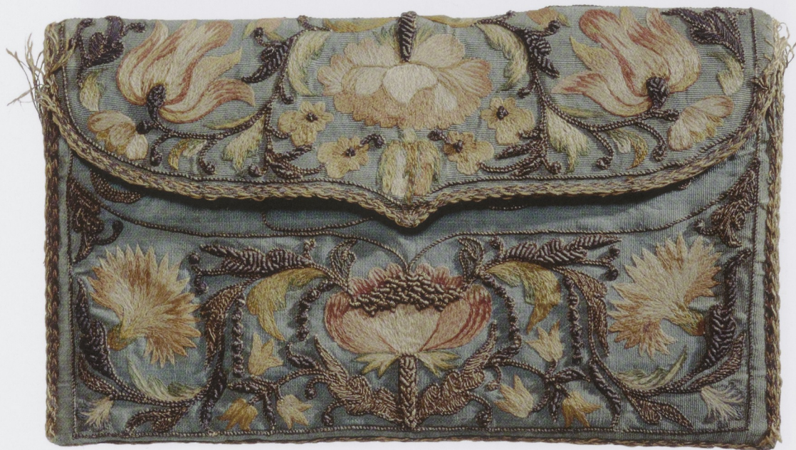
Fig. 8 Cornelis Calkoen’s Letter Case, Istanbul, 1728. Leather, velvet, embroidery, 10 x 17 cm. Private collection (The Netherlands).

Fig. 10 Michiel Adriaansz de Ruyter’s Letter Case, North Africa, c. 1650-76. Leather, linen, velvet, silver thread, 10.3 x 17.8 cm. Amsterdam, Rijksmuseum, NG-NM-10408.