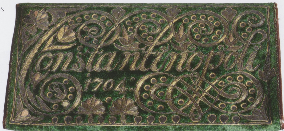
Fig. 5 Jacobus Onversaaght's Letter Case, Istanbul, 1704. Leather, velvet, silk, silver thread, 11 x 19.6 cm. The Hague, Gemeentemuseum, 10-33955.

in the collection of the Gemeentemuseum Den Haag (fig. 5). In this example too, dark green silk velvet has been attached to the leather. In this one, however, a double-folded piece of supple leather has been sewn inside the case, dividing it into three compartments or sections. Each part of the ornament, including the letters, was individually cut from leather and sewn on to the velvet with silver and gold thread embroidery in satin stitch and stem stitch, creating a relief effect. 7 There are curlicues and a figure-of-eight in the calligraphy with rows of knots in the curls. The spaces around