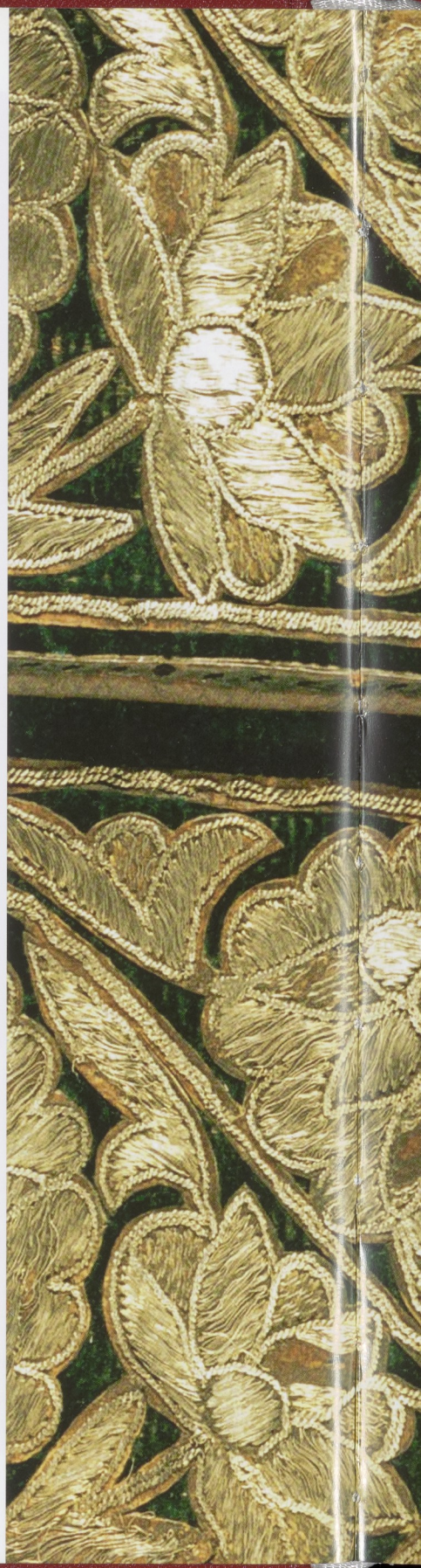
Detail of fig. 4