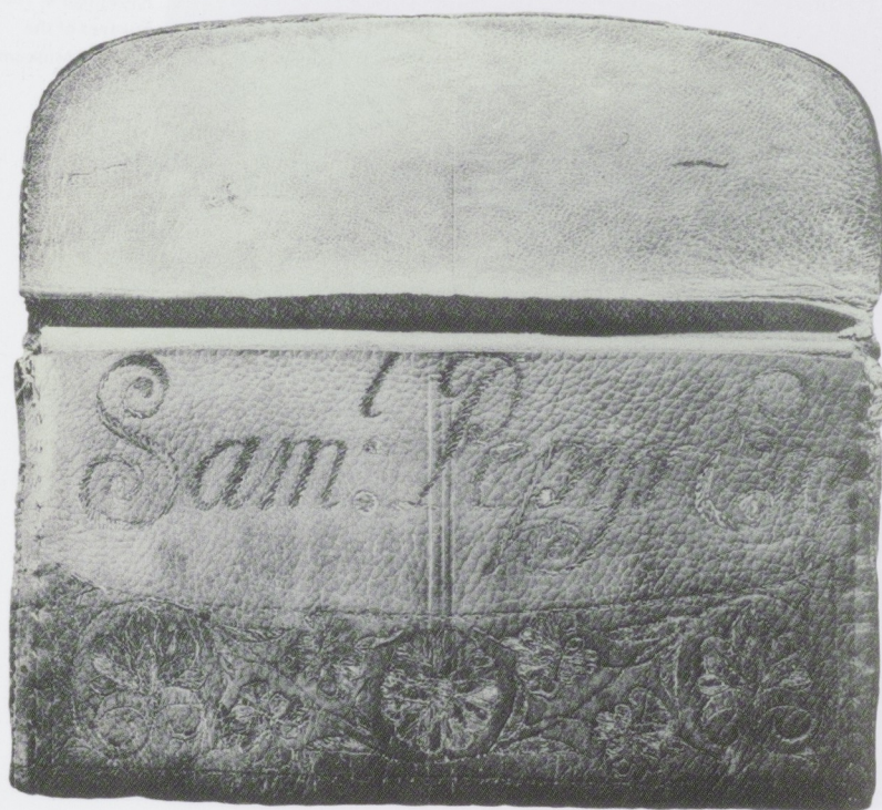
Fig. 3 Samuel Pepys's Letter Case, Istanbul, 1687. Leather embroidered with silver thread, 11.5 x 21.5 cm. Northampton, Museum of Leathercraft.

This is how these treasures ultimately ended up in the houses of wealthy and influential people in the West, like the surviving letter case of the renowned seventeenth-century English diarist Samuel Pepys (fig. 3). 5 This rectangular wallet, 21.5 cm long and 11.5 cm high, is made of brown goatskin. On the front is a pattern of a twining tree branch and three large blossoms in the shape of a medallion, embroidered in silver thread. The owner's name, 'Sam.l Pepys Esq.', is embroidered under the flap and 'Constantinople 1687' has been stitched into the back of the case. The case may very well have been given to Pepys as a gift from a Turkish contact, because as Secretary of the Admiralty he was an influential man with international connections.