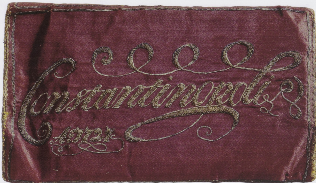
Fig. 7 Cornelis Calkoen's Letter Case, Istanbul, 1727. Leather, velvet, embroidery, 11.5 x 20.5 cm. Private collection (The Netherlands).