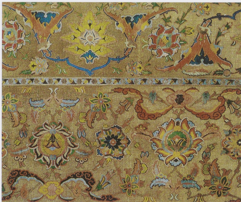
Fig. 1 Detail of the Coronation Carpet, Isfahan, 1650-60. Copenhagen, Rosenborg Palace, 31.1.