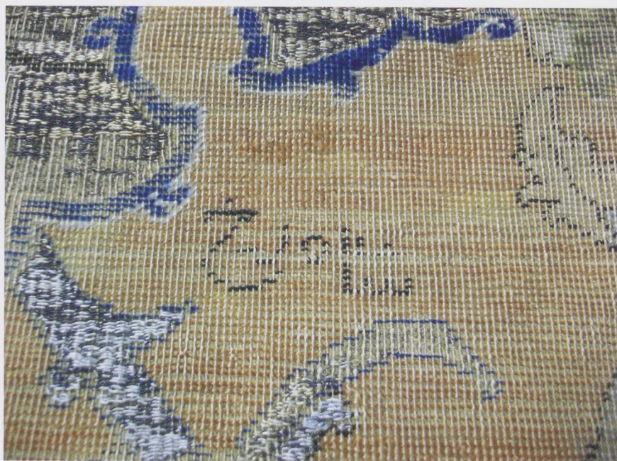
Fig. 3 Detail of fig. 2

in many ways. Its pattern does not fit into any of the systems mentioned, and there is no companion piece with which it would form a pair. It is, moreover, the only knotted carpet in the group to display a series of half-concealed letters, which raises a number of questions. Oriental carpets of the classical era very rarely had inscriptions knotted into their pile. They have a cartouche-like border and are placed on the horizontal axis. 9 This is where the short series of letters خ ره اش ( Sā h r(u)h ) is hidden virtually underneath the arch of the cartouche (fig. 3). The order of the letters has not been unequivocally interpreted as yet. Taken together, they could be read as a man's name in Persian. Taken separately, they are familiar words in poetry and signify something like 'Young man, beautiful countenance'. In other words the inscription does not contain a designer's name, nor the place or date of the carpet's manufacture. A gift dedication or the master's signature would have been positioned more prominently.