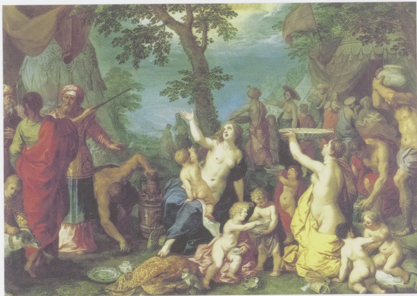
Fig. 10 HENDRIK VAN BALEN, The Children of Israel Gathering the Manna . Copper, 50 x 71 cm. Present whereabouts unknown.

It had come from the stadholders' palace of Het Loo and can probably be identified as the Neptune and