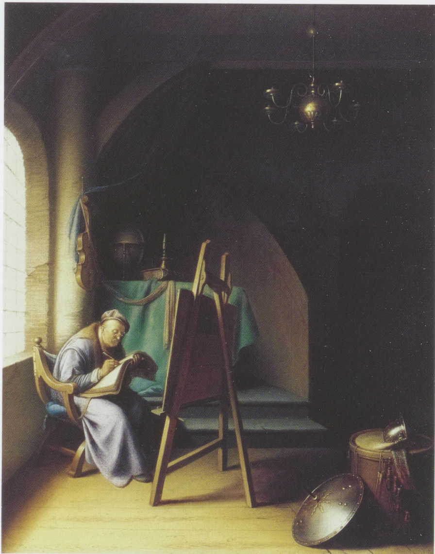
Fig. 5 GERARD DOU, A Man Writing at a Painter's Easel . Panel, 31.5 x 25 cm. Ivor Foundation, New York.

Van der Velde and Wouwerman that fetched the highest prices in 1828. The museum had six and three works respectively by the sought-after fijnschilders or 'fine painters' Gerard Dou and Frans van Mieris. According to the notes in the 1827 Aanwijzing , only Dou's Evening School and Van Mieris's Woman Writing a Letter , both from the Van der Pot Collection, were of the 'finest quality'. A mediocre painting by Dou (fig. 5) from the Van Heteren