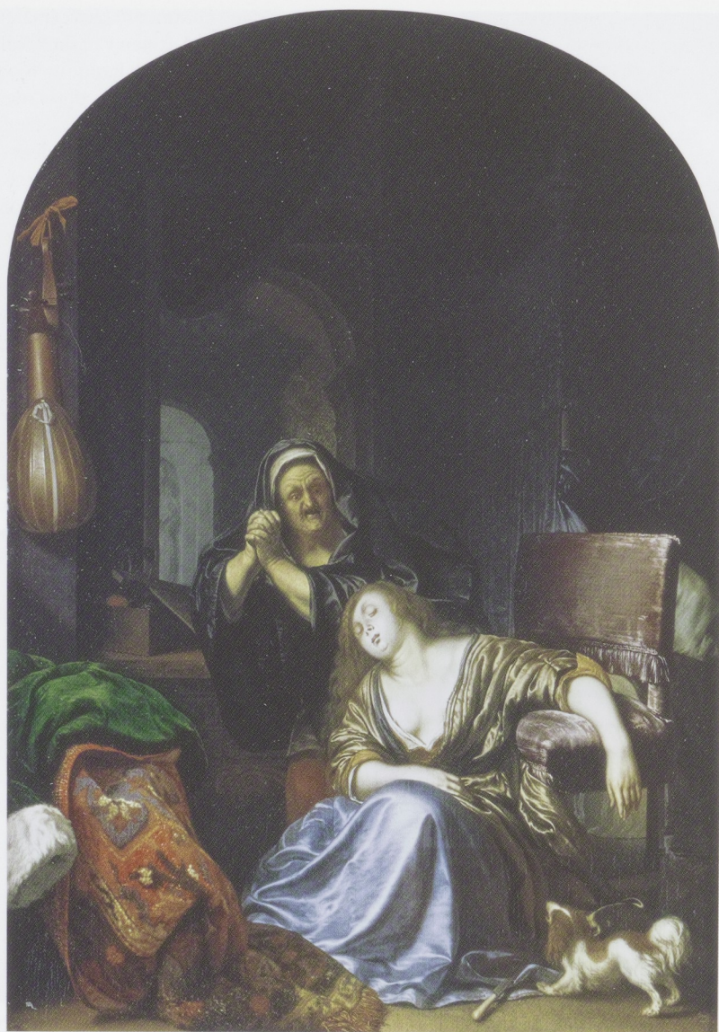
Fig. 6 FRANS VAN MIERIS, The Death of Lucretia . Panel, 38 x 27 cm. Private collection, New York.

Collection and two of his works that did not even appear in the museum catalogues were sold. 18 The rather melodramatic Death of Lucretia of 1679 (fig. 6) by Van Mieris was sold in 1828. 19 The works by these painters and also by Adriaen van Ostade that were disposed of are clearly of lesser quality than those that remained behind in the Trippenhuis. 20 Although none of the paintings by Paulus Potter, David Teniers, and Willem van der