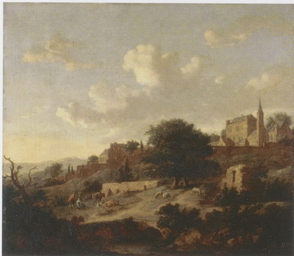
Fig. 8b JAN VAN DER HEYDEN AND ADRIAEN VAN DE VELDE, Landscape with Buildings . Copper, 20 x 23.3 cm. Museum Kunst Palast, Gemäldesammlung, Düsseldorf.