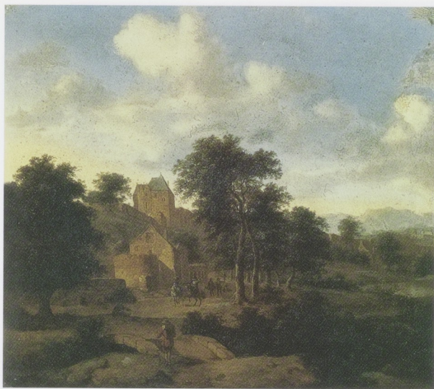
Fig. 8a JAN VAN DER HEYDEN AND ADRIAEN VAN DE VELDE, Landscape with Buildings . Copper, 20 x 23.3 cm. Private collection, London.