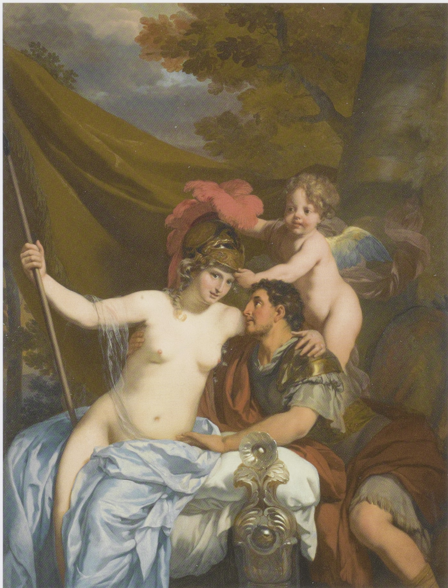
Fig. 13 GERARD DE LAIRESSE, Mars and Venus , c. 1680. Canvas, 125 x 95 cm. Rijksmuseum, Amsterdam (inv. no. SK-A-211).

works of art, about which there was a lack of knowledge or for which there was little regard, which have been exchanged or sold, usually for modest sums.