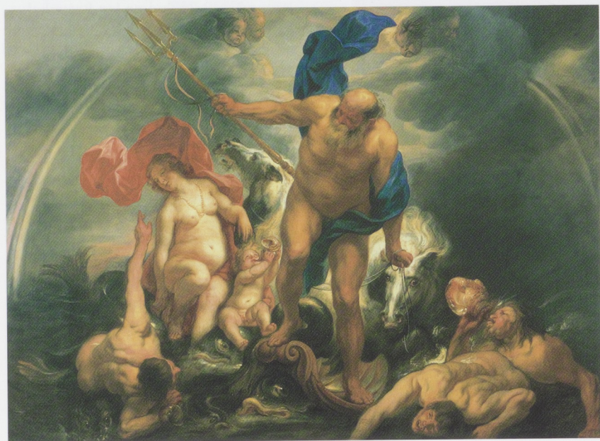
Fig. 11 JACOB JORDAENS, Neptune and Amphitrite , 164[...5?]. Canvas, 200 x 306 cm (enlarged on two sides). The Rubens House, Antwerp, photo Musea en Erfgoed Antwerpen, Lowie de Peuter/ Michel Wuyts.