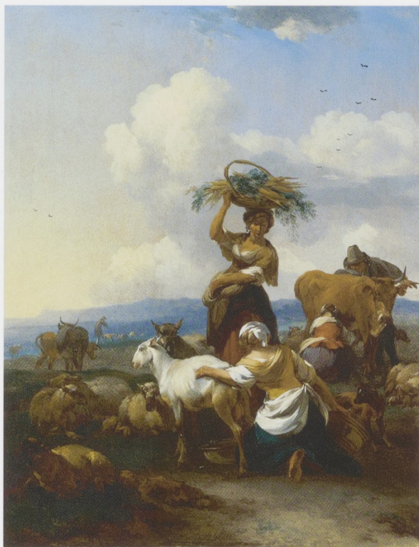
Fig. 7 NICOLAES BERCHEM, Italian Landscape with Standing Peasant Woman with a Basket of Vegetables and Milkmaids Milking . Panel, 31.6 x 25 cm. Private collection, Amsterdam (formerly Noortman Gallery, Maastricht).

received Apostool's 'finest quality' designation in the 1827 Aanwijzing , and the tiny Italian Landscape from the Van der Pot Collection was termed 'first quality'; furthermore the collection still had the famous Three Herds , for which Van der Pot had paid 3,025 guilders at auction, the Ferry and a Winter Scene . Of the Berchems that were sold, the Landscape with Beasts and Figures ended up in Montreal and an Italian Landscape with Figures is still in a private collection (fig. 7). 22