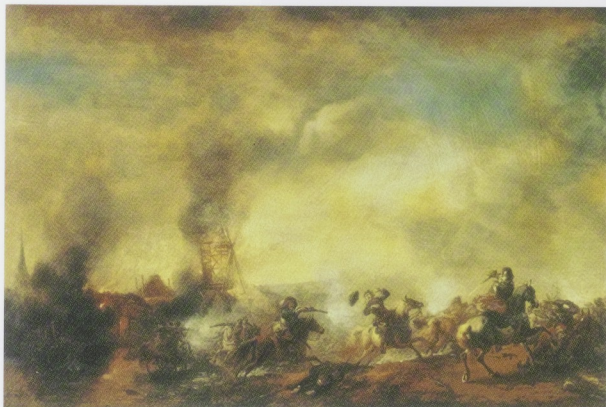
Fig. 9 PHILIPS WOUWER- MAN, Plundering of a Village with

Burning Mill . Panel, 53.7 x 79.3 cm. Present whereabouts unknown.