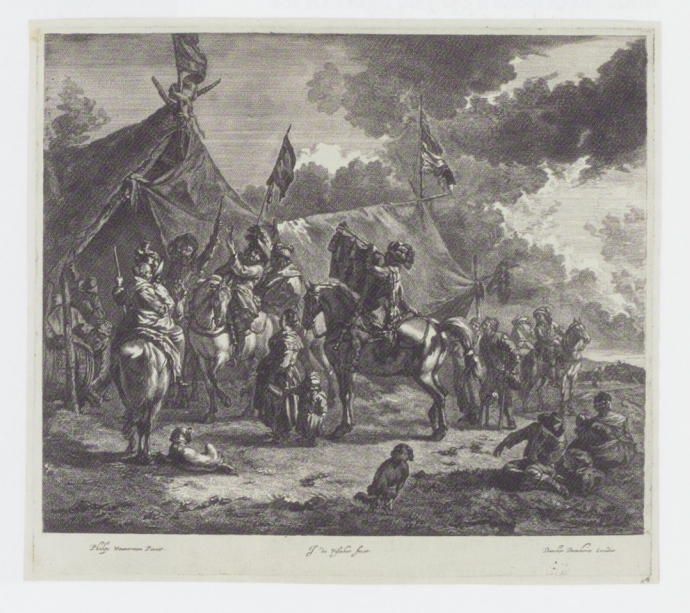
Fig. 5 JOHANNES VISSCHER AFTER PHILIPS WOUWERMAN, Army Camp with a Trumpeter. Etching and engraving, 34.5 × 39.2 cm. Amsterdam, Rijksprentenkabinet (fourth sheet of a series of four, inv. no. RP-OB-62.019).