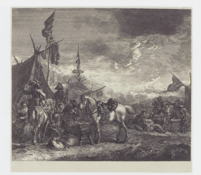
Fig. 4 JOHANNES VISSCHER AFTER PHILIPS WOUWERMAN, Horse at a Trough in an Army Camp. Etching and engraving, 35.8 x 39.3 cm. Amsterdam, Rijksprentenkabinet (third sheet of a series of four, inv. no. RP-OB-62.018).

In a number of cases the faience painter made minor alterations to the poses of the figures. The rider seen from the front outside the right-hand tent, for instance, does not have his arm raised as he does in the print. The most striking change, though, is in the horseman in the centre. In Visscher's print he is shown in profile, whereas here he looks out at the viewer; his hat and his pose have also been modified. Although the elements from the different prints have been put together skilfully and are in proportion to one