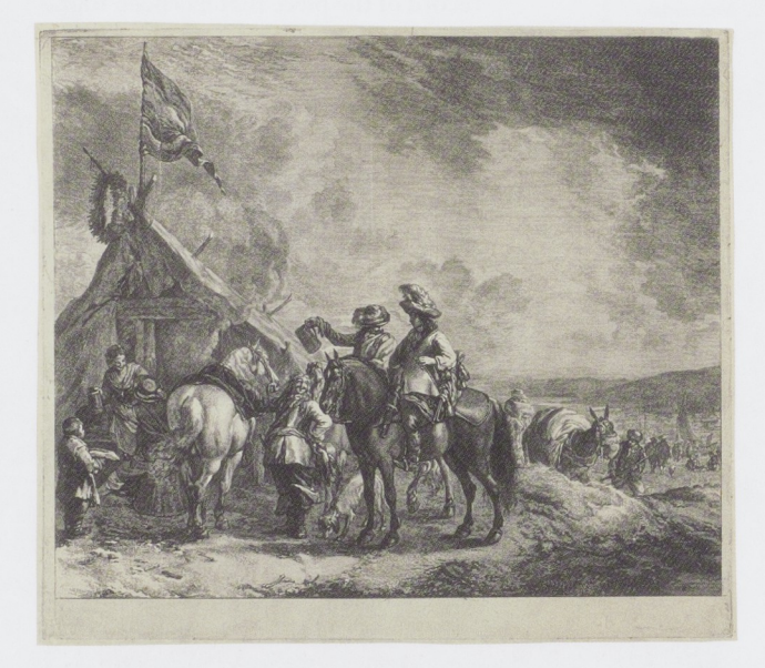
Fig. 2 JOHANNES VISSCHER AFTER PHILIPS WOUWERMAN, Horsemen by a Sutler's Tent. Etching and engraving, 34.5 × 39.2 cm. Amsterdam, Rijksprentenkabinet (first sheet of a series of four, inv. no. RP-OB-62.014).

Fig. 3 JOHANNES VISSCHER AFTER PHILIPS WOUWERMAN, Three Horsemen by a Sutler's Tent. Etching and engraving, 35,8 x 41,7 cm. Amsterdam, Rijksprentenkabinet (second sheet of a series of four, inv. no. RP-OB-62.016).