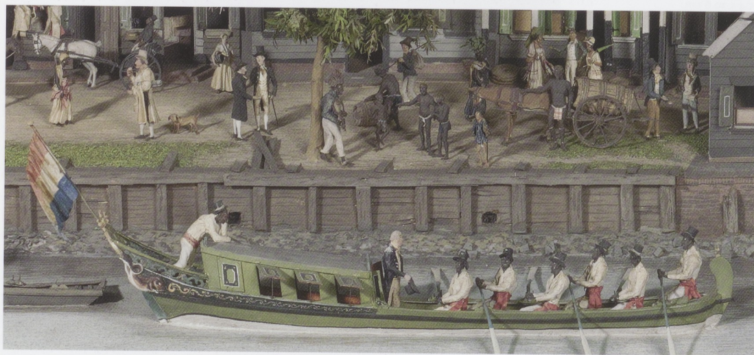
Fig. 9 Detail of fig. 1 of a tent boat (detail NG-2007-50).

reproduction of the topographical reality make the diorama of the Waterkant one of the finest pieces by Gerrit Schouten we know of. It is also important in another respect: a year after it was made, that part of Paramaribo burned to the ground. This event makes the diorama an extremely important historical source. The fire broke out on Sunday 21 January 1821 in the backyard of a house on the Waterkant. The fire rapidly crossed to a warehouse behind the house and then spread quickly, fanned by the wind. Four hundred houses and eight hundred warehouses and outbuildings were destroyed. Public buildings, among them churches, the theatre, the weigh-house and the offices of the Board of Orphans, also went up in flames. H. Uden Masman Sr, minister of the Koepelkerk, described the fire and its dramatic consequences, 'At the end of the Watermolenstraat, at the Waterkant, the fire crossed over the house or office of the customs officer to the other side of the street, and about ten in the evening both this side of it and the Waterkant and the Knuffelsgracht were burned down as far as the so called 'English Bridge'. In extraordinary confusion, the house of the innkeeper Schwaan, which was