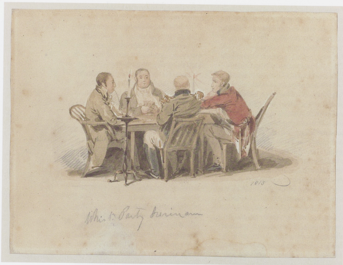
Fig. 7 ANONYMOUS (English school), Whist Party Surinam , 1813. Drawing, 15.4 x 20.6 cm. Amsterdam Rijksmuseum (inv. no. NG-2009-1).