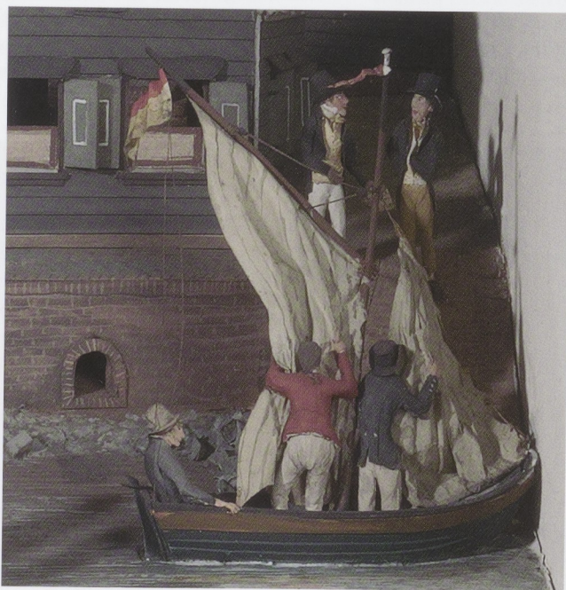
Fig. 8 Detail of fig. 1 of two men beside the customs house (detail NG-2007-50).