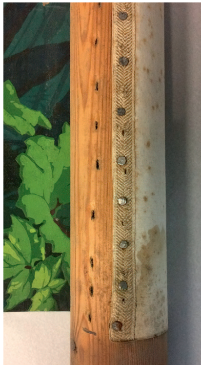
Fig. 10 Detail showing the right hand side of the El Dorado wall-paper attached to a wooden pole with nails through a piece of twill tape (fig. 4).

Taking all these indications into account, we were left with only one convincing conclusion as to the function of these objects: the four hand-painted panoramic landscapes must have once been part of a moving panorama (fig. 11).