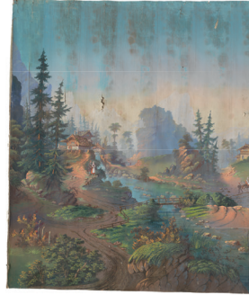
inv. no. BK-18283-D

The longest object in the set – the one that will be on view in XXL Paper – is 2,309 centimetres long in total and depicts what one might easily describe as a fairytale setting (see figs. 1a, b). The bright, warm and iridescent colours, such as glowing purples and fiery oranges, transport us to a far-away place. The landscape features an endless array of mountaintops in the background and alternating passages of land and water in the middle ground.