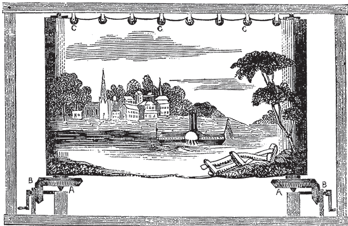
Fig. 11 Illustration of a moving panorama designed by John Banvard, 1848 (see note 44).

Illusion and spectacle, the unfamiliar and the unknown dominated the popular entertainment of the nineteenth century. Theatre, travelling circuses, pantomimes and grand World Fairs were more popular than ever. Responding to the general population's curiosity about far-away countries, recent historic battles and different cultures, stimulated by voyages of discovery, the Grand Tour as well as industrialization and changes in transportation (for instance, the railway and hot-air balloons), entrepreneurs developed new forms of amusement. These novel commercial