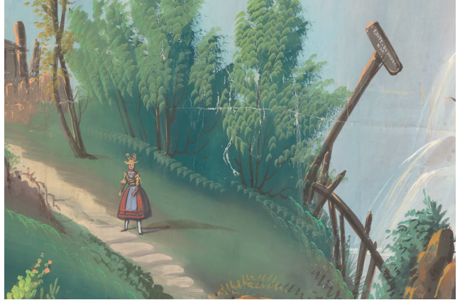
Fig. 15 Detail with the signpost with the text Route du Rocher (fig. 8).

of thirty thousand square feet of painted surface. 35 Assuming the height of the cyclorama was, as our fragments are, 180 centimetres, the total length of the moving panorama – whether or not divided over different spools – would thus have been one and a half kilometres. 36 The total length of what remains of the fragments held in the Rijksmuseum collection today is only fifty-eight metres, in other words, only a small part of the original cyclorama.