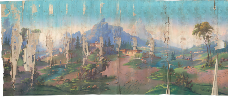
inv. no. BK-18283-B