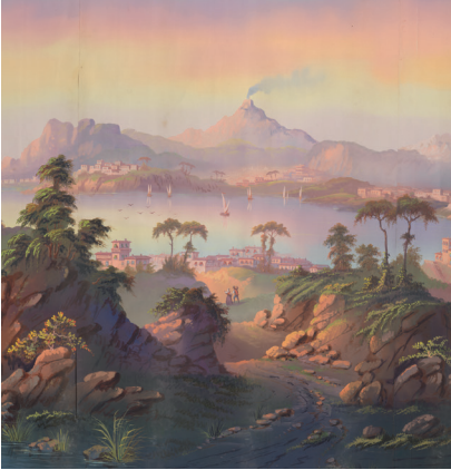
Fig. 14 Detail with the smoking volcano, possibly Mount Vesuvius (fig. 1).