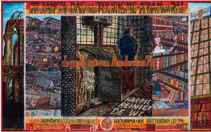
Fig. 11 WILLEM VAN GENK, The Great Naïves , c. 1974. Oil on an assembly of cardboards, 54.5 x 88.5 cm. Amsterdam, Galerie Hamer.

That the Netherlands also still wished to see native Dutch naïves becomes evident from the success of the publication Naïeve schilders zien ons land (Naïve Painters See Our Country), which was published in a large edition as book of the month in 1978, accompanying an exhibition in the Singer Museum in Laren and a television report by the NCRV. 47 Daily newspaper Het Parool wrote rather disparagingly of ‘a bewildering quantity of little houses, boats, trees and bridges’ (e. g. fig. 12), but otherwise the reception was favourable. 48 The same was true of the book Naïeve kunst , also published in 1978, in which Gans went to great lengths to distinguish this ‘fringe phenomenon’ from children’s drawings, the artistry of the mentally ill, amateur art, folk art and kitsch. 49 Van Genk, however, was not named in any of these categories.