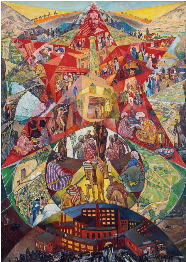
Fig. 13 HEINRICH VOGELER, Karelia and Murmansk (Russian Federation) , 1926. Oil on canvas, 125 x 90 cm. Berlin, Staatliche Museen zu Berlin, Nationalgalerie, inv. no. A III 273/960158.

This quarrel has still not been resolved, in part because both sides in the debate are talking at cross purposes. On the one hand, the supporters of outsider art emphasize (supposedly beneficial) immunity with respect to the (accursed) art circuit and see this label as either neutral or positive, because it finally gives these previously invisible artists a platform. On the other hand, critics (not so much of this art, but of its supporters) argue that this romanticizing stamp locks these people up in a (conceptual) reservation, ghetto, cabinet of curiosities or freak show, shutting them out even more than they already were; in their ears, the effect of the term is not emancipating, but denigrating, stigmatizing and marginalizing. 66 Both sides have a point, but are clearly fighting a different injustice. The call for an alternative label, resounding already for decades, has produced many suggestions (‘self-taught’, ‘marginal’, ‘spontaneous’, ‘visionary’, ‘singular’, etc.), but none have proved complete, understandable or appealing enough to be able to replace the contested word ‘outsider’. 67 Nevertheless, in 2015 The Huffington Post began to demonstrably write about ‘the “O”-word’. 68