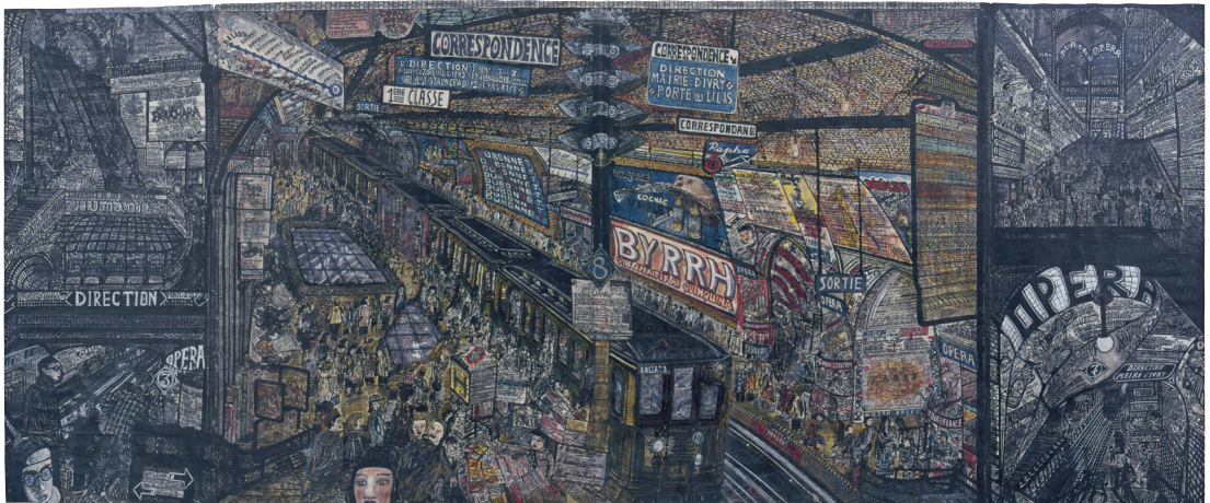
Fig. 9 WILLEM VAN GENK, Metrostation Opéra , c. 1963. Ink, ballpoint and watercolour on paper, 67,5 x 160 cm. Amsterdam, Stedelijk Museum, inv. no. A 24243.

Van Genk continued to fall between two stools in the Netherlands as well. When Tegenbosch was asked to introduce him in 1976 for an exhibition at the De Ark Gallery in Boxtel, he clearly did not know where to put him: Van Genk seemed to him to be a