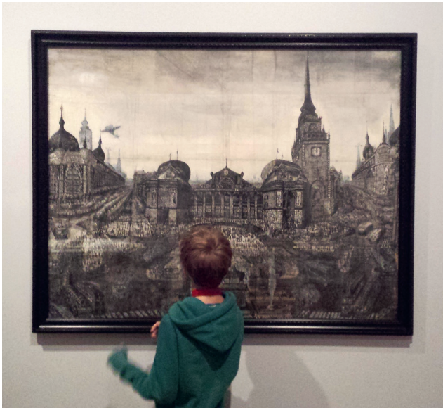
Fig. 15 View of gallery with young visitor in front of Willem van Genk's Moscow . Department of twentieth-century art, Rijksmuseum Amsterdam, August 2017.

And this is why the much more modest honour bestowed on Van Genk by the Rijksmuseum in 2016, when it included Moscow for a year in its presentation of twentieth-century Dutch art, is so much more significant (fig. 15). Despite being described on the museum label as a schizophrenic patient (which seems doubtful as well as irrelevant), his work hung here like that of any other artist, as he had most likely always wanted. 80 The somewhat bitter irony is that the art brut and outsider art circuit, which did so much to get Van Genk recognized, is unable to take this last, ultimate step, based as it is on the distinction and separation of outsiders from insiders. Exclusiveness, by definition, precludes inclusiveness. 81