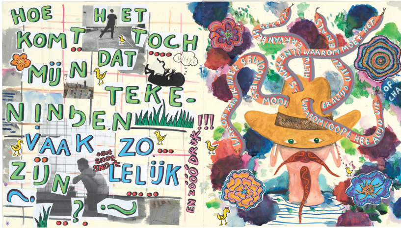
Sheets 3 and 4