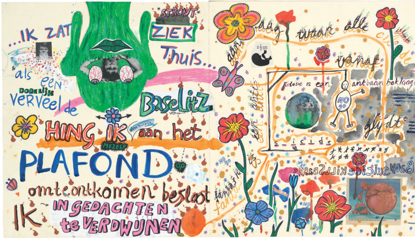
Sheets 1 and 2