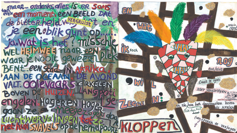
Sheets 9 and 10