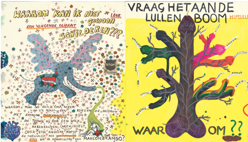
Sheets 5 and 6