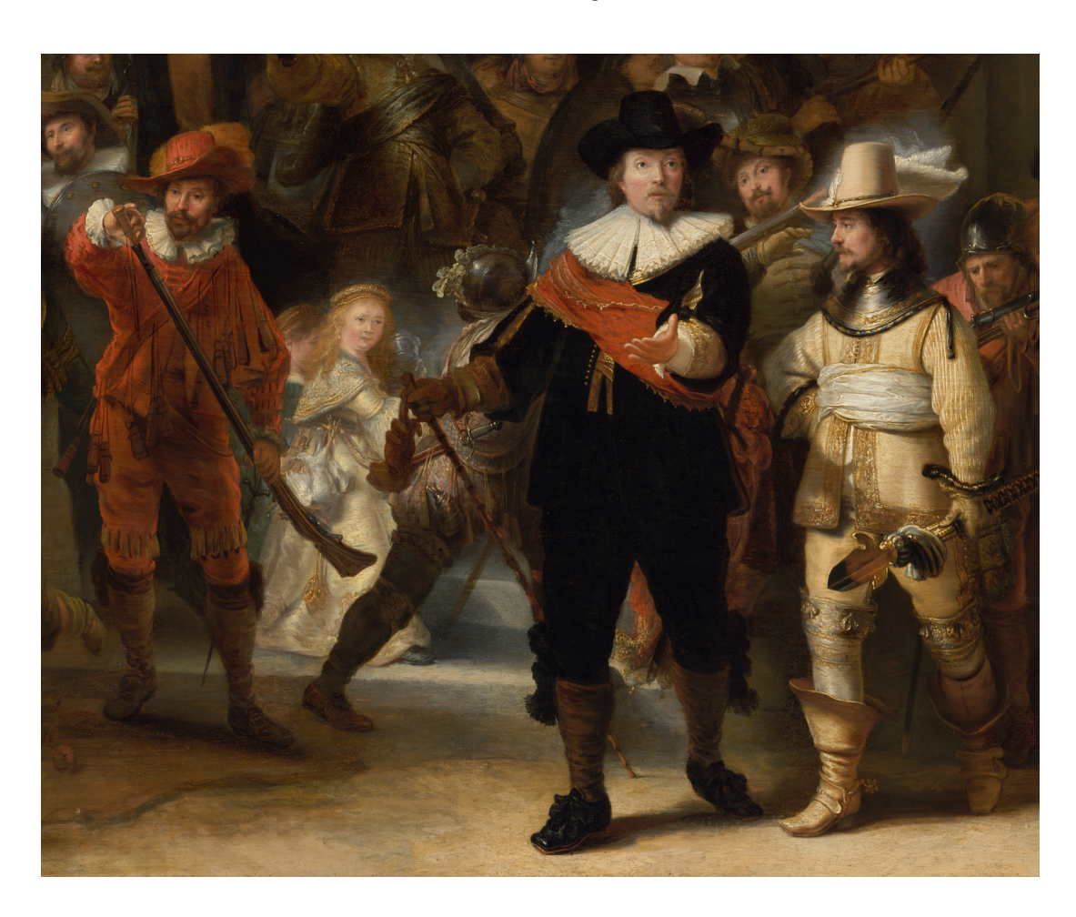
Fig. 6 Detail of the copy of The Night Watch (fig. 1).

partner, dressed in light clothes like Banninck Cocq's lieutenant, Willem van Ruytenburgh, who is positioned just behind him. There are two more conspicuous similarities in Lundens's work. First of all, there is the dark leg, almost in silhouette, of a pickpocket at the fair, contrasting with the pale yellow gown of the woman to the left of centre of the composition. This corresponds with the young militiaman's leg, which stands out against the cream-coloured dress worn by the girl darting between the guardsmen. Secondly, the sleeve of the dark red dress worn by a visitor to the fair seen from behind echoes the compositional element of the stock of the weapon held by the musketeer, likewise dressed in red, in The Night Watch.