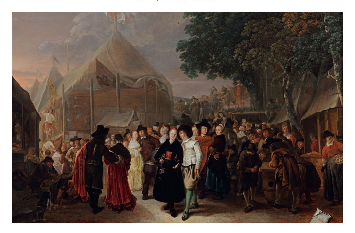
Fig. 2 GERRIT LUNDENS, The Fair-Goers, c. 1642-49. Oil on panel, 54 x 83 cm. Private collection.

Fig. 3 JACOB COLIJN (attributed to), Copy after The Night Watch, с. 1653-55. Charcoal and watercolour, 14 x 18 cm. Amsterdam, Rijksmuseum, inv. no. sk-c-1102, Album of Frans Banninck Cocq, vol. 2, fol. 142; on loan from Jonkheer J. de Graeff, Delft.