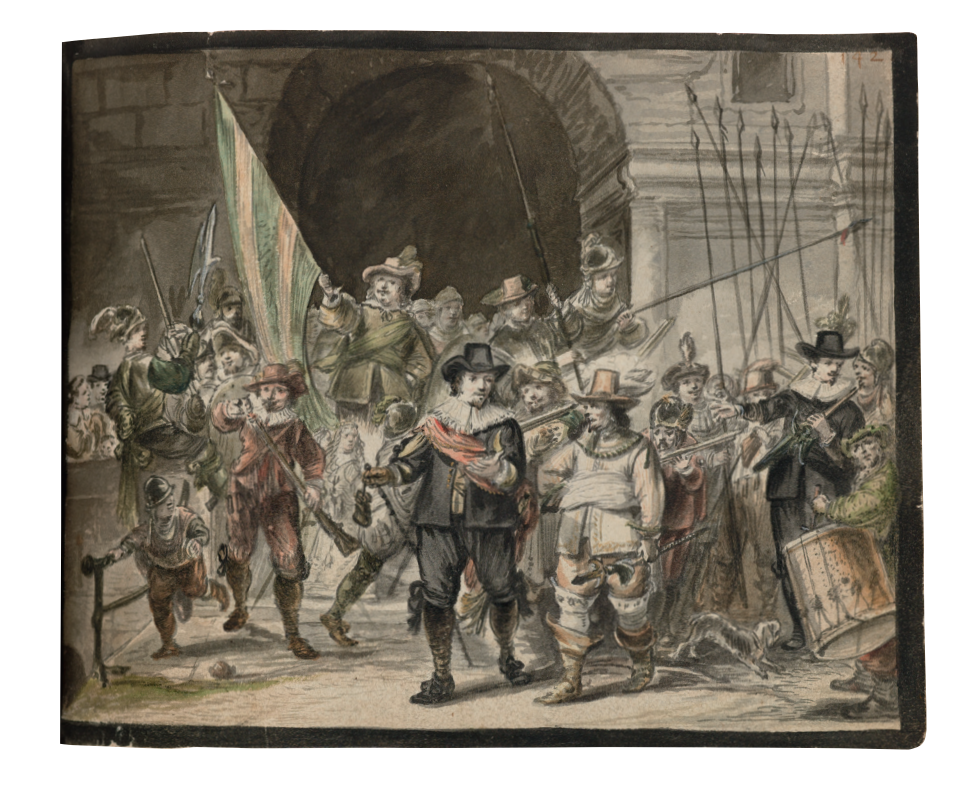
Fig. 3 JACOB COLIJN (attributed to), Copy after The Night Watch, с. 1653-55. Charcoal and watercolour, 14 x 18 cm. Amsterdam, Rijksmuseum, inv. no. sk-c-1102, Album of Frans Banninck Cocq, vol. 2, fol. 142; on loan from Jonkheer J. de Graeff, Delft.