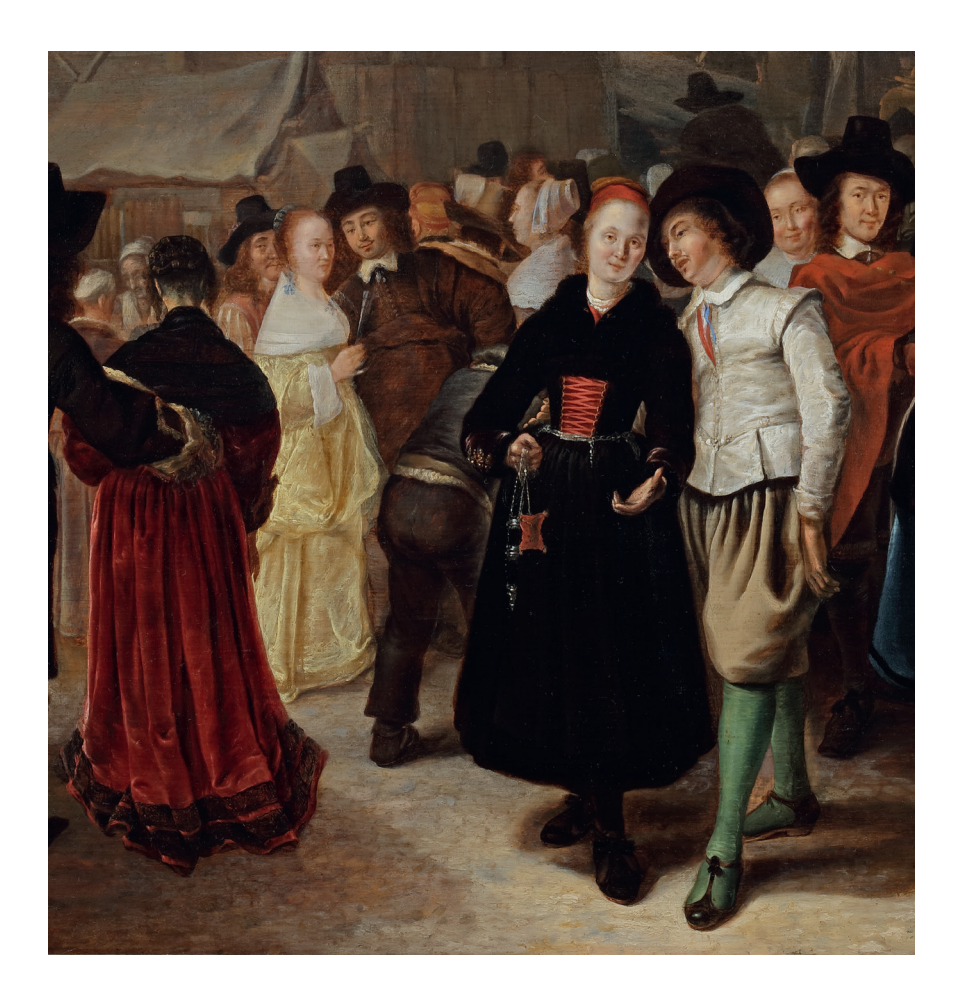
Fig. 5 Detail of The Fair-Goers (fig. 2).

Of the ten derivatives, The Fair-Goers is the most closely related genre work (fig. 2).<sup>18</sup> In one of the newspaper reviews of the exhibition Zeventiende-eeuwse meesters in Gelders bezit in 1953 it was even jokingly described as 'plagiarism' because of the parallels