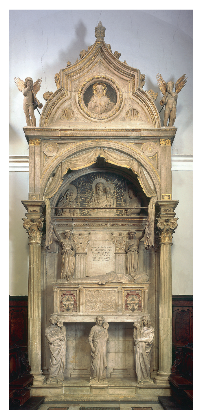
Fig. 6 DONATELLO AND MICHELOZZO, Tomb of Cardinal Rainaldo Brancaccio, c. 1425-27.

Although not all the questions raised by Antonio Rizzo's tondo have been answered, most particularly its original location, what is clear is that this graceful piece of sculpture is of