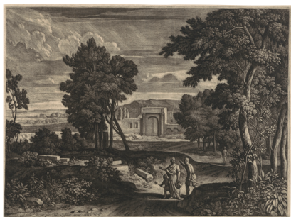
GERARD HOET, Landscape with Four Figures , 1664-1709. Mezzotint, 255 x 344 mm. Amsterdam, Rijksmuseum, inv. no. RP-P-1906-3426.