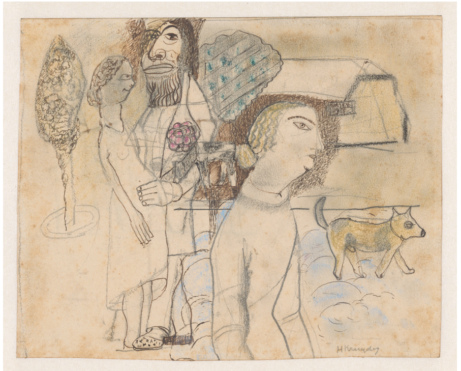
Recto of inv. no. RP-T-2016-6