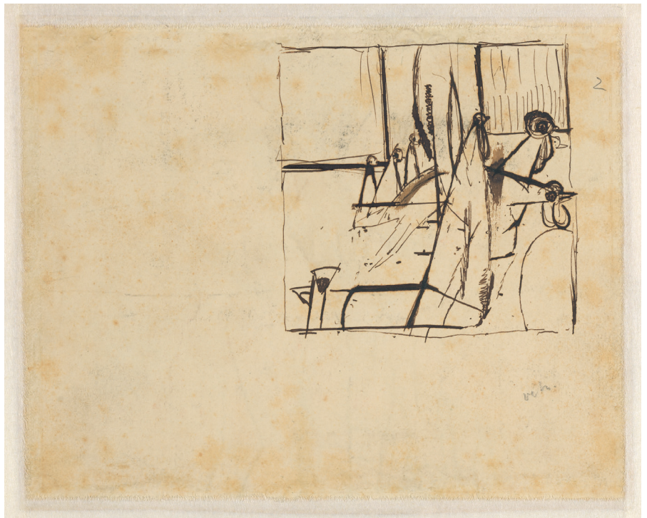
Verso of inv. no. RP-T-2016-6