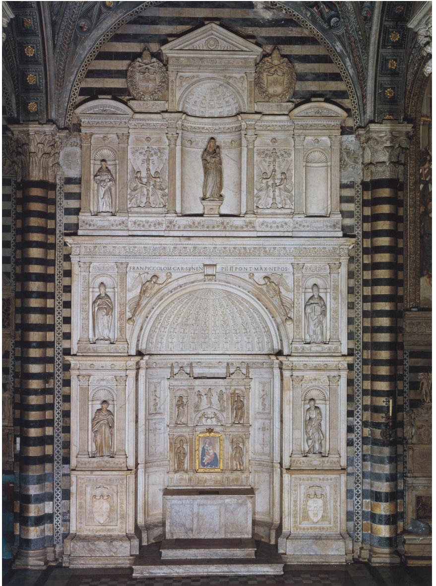
Fig. 17 ANDREA BREGNO, MICHELANGELO et al., Piccolomini Altar in the Piccolomini Chapel, 1481-1504. Marble. Siena, Duomo.

nificant extent from the Renaissance decorations on the Piccolomini altar in Siena Cathedral (fig. 17). The slender decorative motifs on the friezes and borders of the little panel are in part simplified grotesques of a kind that came into fashion in Siena soon after 1500. 39 It is not without significance that this all'antica style of decoration from Rome was introduced to the city through the patronage of the