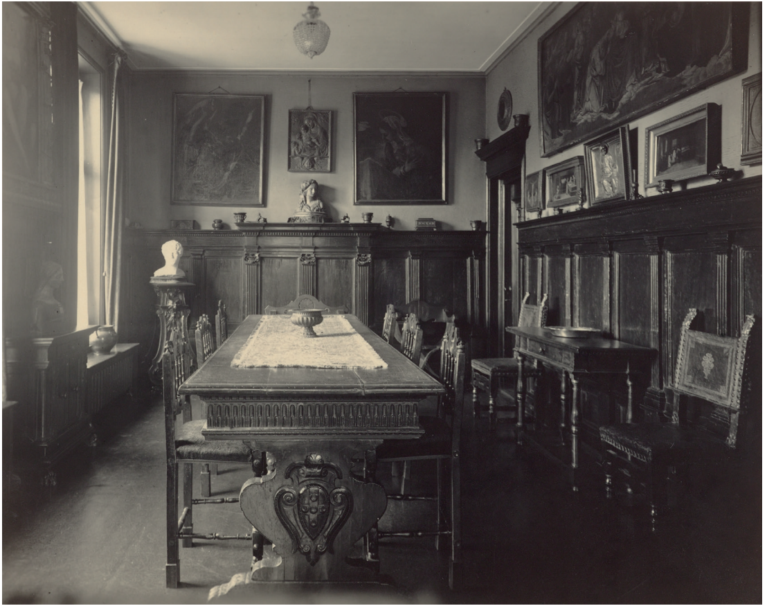
Fig. 2 Interior of Otto Lanz's house with the 'Piccolomini' dining table.

Drouot in March 1911, when the stock of the deceased Parisian art dealer Jules Lowengard went under the hammer. 9 In the second part of this sale, devoted wholly to Italian Renaissance art and decorative art objects, we find it as no. 96, catalogued as 'travail siennois de la fin du xve siècle' but without an attribution to Barile (or Barili). 10 According to the Gazette de l'Hôtel Drouot , it fetched the not inconsiderable sum of 5,950 French francs. 11 Lanz would undoubtedly have had to shell out a good deal more than that.