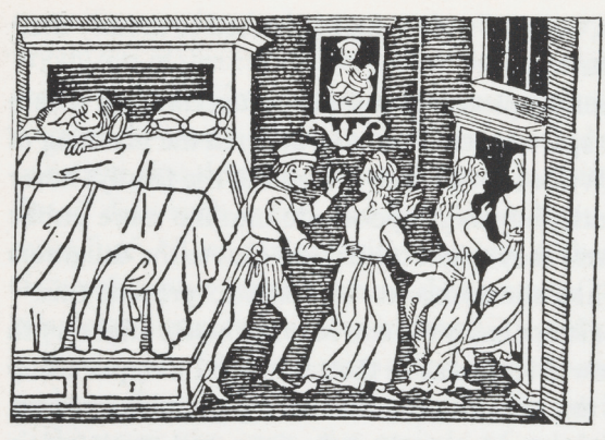
Fig. 10 Interior with bedchamber and a devotional tabernacle on the rear wall. Illustration in Questo sie la nobilissima historia di Maria per Ravenna , Venice, c. 1540. Amsterdam, Rijksmuseum Research Library, 447 A 14.