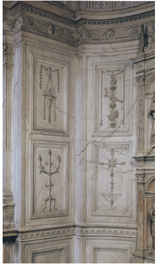
Fig. 20 ANDREA BREGNO, Panel with Pendant Lamp (detail of fig. 17), 1481-85. Marble. Siena, Piccolomini Chapel.