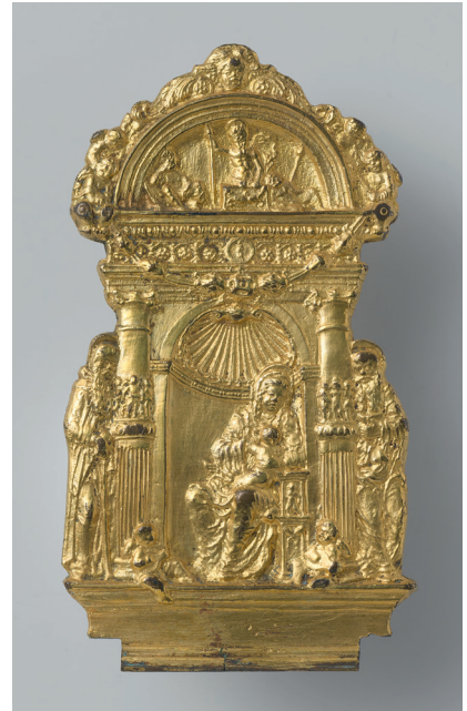
Fig. 12 GALEAZZO MONDELLA called MODERNO, The Virgin and Christ, Flanked by St Anthony and St Jerome (plaque transformed into a pax), Verona (?), c. 1490. Gilded bronze, 10.7 x 5.8 cm. Amsterdam, Rijksmuseum, inv. no. BK-NM-11919.

The central image must have been of exceptional workmanship, otherwise we are at a loss to explain why it was removed from the niche at some point,