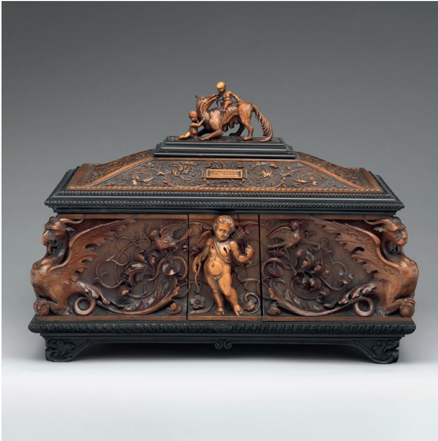
Fig. 14 PIETRO GIUSTI, Jewellery Casket , Siena, 1857. Walnut and ebony, 28 x 38 x 26 cm. New York, Metropolitan Museum of Art, inv. no. 1998.19; gift of John D. Rockefeller, by exchange, and Rogers Fund, 1998.

repertoire, such as the Régence crest and the guilloche border on a mirror frame by Bartolozzi and Ferri dating from 1870 (fig. 15), and Renaissance decorations on objects that did not exist, or at least not in that form, in the sixteenth century, such as a jewellery casket and even a piano. 29 This time, however, Lanz had not bought a pig in a poke. There can be little doubt that his fine tabernacle was made by a sixteenth-century woodcarver, a