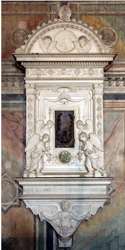
Fig. 7 MINO DA FIESOLE, Wall Tabernacle, c. 1473. Marble. Florence, Santa Croce.

three zones: the niche, the pediment-shaped entablature and a tapering lower zone. In the centre is a small bronze door, behind which the host is kept. Iconographically, everything here points to the sacrament of the Eucharist: in the 'heavenly' upper register, two cherubs flank an empty tondo – the host – which is brought by way of the ceiling of the niche below it to the faithful on earth. There it appears again, now as Christ in bronze on the little door in the middle and below as an inlaid round of green marble, surrounded by four angels carrying candles. The inscription on the base pithily sums up this iconography: Hic est panis vivus q[ui] de celo descendit . 13 In the lowest zone an angel holds a banderol.