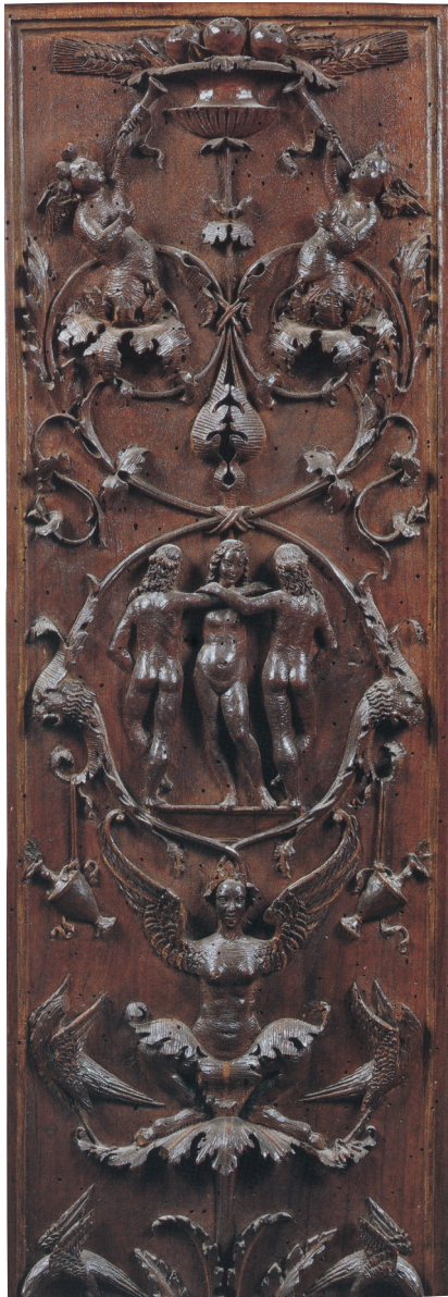
Fig. 16 ANTONIO DI NERI BARILI, Pilaster , One of a Set of Twelve, for the Palazzo Petrucci , Siena, 1509. Walnut, 200 x 30 cm. Siena, Pinacoteca Nazionale/ Soprintendenza per il Patrimonio Storico Artistico ed Etnoantropologico.

The modern repertoire of motifs Barili used, which can also be detected in Lanz's carving, was derived to a sig-