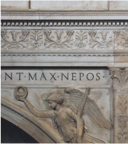
Fig. 19 ANDREA BREGNO, Frieze with Alternating Cornucopia (detail of fig. 17), 1481-85. Marble. Siena, Piccolomini Chapel.