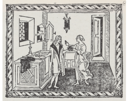
Fig. 11 Interior with San Grisante and Daria and a devotional tabernacle on the rear wall. Illustration in La rappresentazione di San Grisante & Daria , Florence 1559 (woodcut before 1500). Amsterdam, Rijksmuseum Research Library, 447 A 14.

tion to the rule – small tabernacles for personal devotion like these hung in bedrooms. Other sources confirm that the bedroom was the favourite place for private devotional objects. 22 At the same time it ties in with the fact that in medieval art the Annunciation to the Virgin was usually situated in her bedroom, where she is interrupted during her meditation by the Archangel Gabriel.