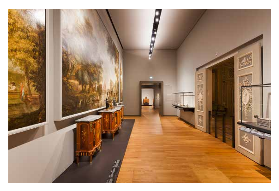
Fig .7 JURRIAAN ANDRIESSEN, Wall Hangings with a Dutch Landscape, 1776. Oil on canvas, 326 x 296 cm. Originally in the house at 22 Nieuwe Doelstraat. Amsterdam, Rijksmuseum, inv. nos. BK-2011-38 to 43; on loan from the Amsterdam Museum. Current display in the Rijksmuseum.

three non-consecutive parts of this set of six paintings in a rather narrow gallery. Presenting them together with contemporary furniture and decorative objects such as candelabras and a Parisian-made gilt-bronze mantel clock created the suggestion of a room (fig. 7). Although the display of these works was carefully considered and thought through, the result is nevertheless a clear illustration of the compromises that have to be made in presenting these interior paintings in a museum setting, out of their original context.