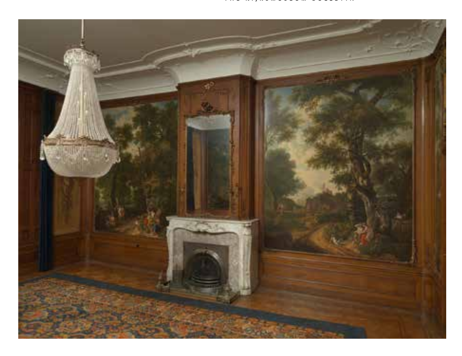
Fig. 2 IURRIAAN ANDRIESSEN, Arcadian Landscape and Two Trophies, 1771. Oil on canvas wall hangings in situ in the garden room of the main floor at 524 Herengracht, various dimensions. Amsterdam. Riiksmuseum. inv. nos. sk-a-4854-a to J and sk-A-4855-A and B; H.L.P. Jonas van 's Heer Arendskerke-Lefèvre de Montigny Bequest.

was taken out of the room and displayed separately in an exhibition about the representation of the landscape in the eighteenth and nineteenth centuries (On Country Roads and Fields, Rijksmuseum). The individual display of the fragment – as if it was an easel painting – outside the room for which it was specifically designed, subverted the very meaning, understanding and appreciation of the work. This was illustrated by a newspaper review of the 1997 exhibition. When discussing Andriessen's painting, the journalist commented that it must have felt cramped to live among these painted wall hangings. He concluded that this must have been why the fashion for painted ensembles did not last long. To call a tradition that lasted for over a century and a half a short-lived trend illustrated how limited the knowledge of these ensembles then was.6 Since this exhibition, general awareness, understanding and appreciation of painted wall hangings has improved, but the difficulty of exhibiting ensemble paintings outside their original setting in a way that respects their original