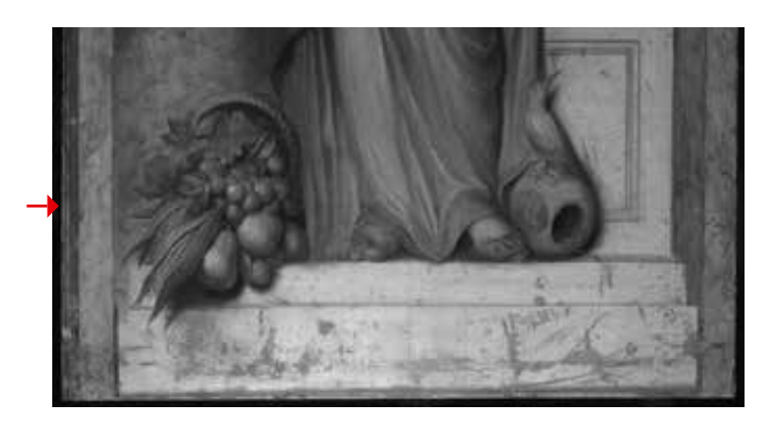
overp unde are vi Fig. 13 with a Infrared reflectogram fig. 10 of detail of the overdoor, sketchy under-

of the paintings at the time they were acquired, it was obvious that several details had been overpainted. This was confirmed by infrared reflectography, a non-invasive imaging technique that can penetrate paint layers, revealing preparatory sketches and underdrawing containing carbon (fig. 12).23 The infrared image showed an elaborate underdrawing - Andriessen's initial stage. The underdrawing in the two allegorical figures is the same type of preparation found using infrared reflectography in the overdoor painting and gives insight into the carefully calculated proportions and placements of the figures and architectural elements. In fact, the underdrawing shows that Andriessen followed the guidelines of classicism advocated by De Lairesse, whom he greatly admired.24 There is a vertical line in both paintings to indicate the middle of the niches. On this line are marks perfectly dividing the female figures into eight sections, in accordance with the classical ideal of human proportions (figs. 13-14). To confirm the theory of the original placement of the wall hangings, it was important to investigate the edges of the canvases. Paper tape had been applied to the edges of the canvases during the