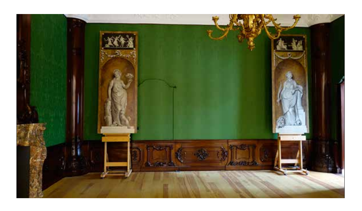
Fig. 21 Temporary installation, 'trial' of the wall hangings in the Beuning Room, 2015.

The Andriessen Beuning Room case study illustrates the importance of integrated research, not only of the individual objects themselves, but also of the context when dealing with parts of ensembles. Such a study is necessary to present the female personifications in a museum setting and help decide on the conservation treatment of the canyases.