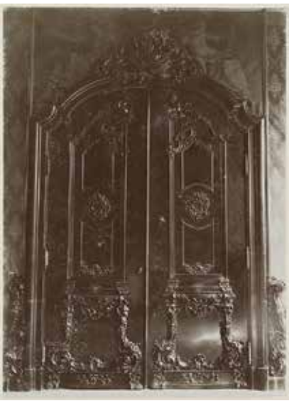
Figs. 8a and b Photographs taken before the dismantling of 187 Keizersgracht in 1896.