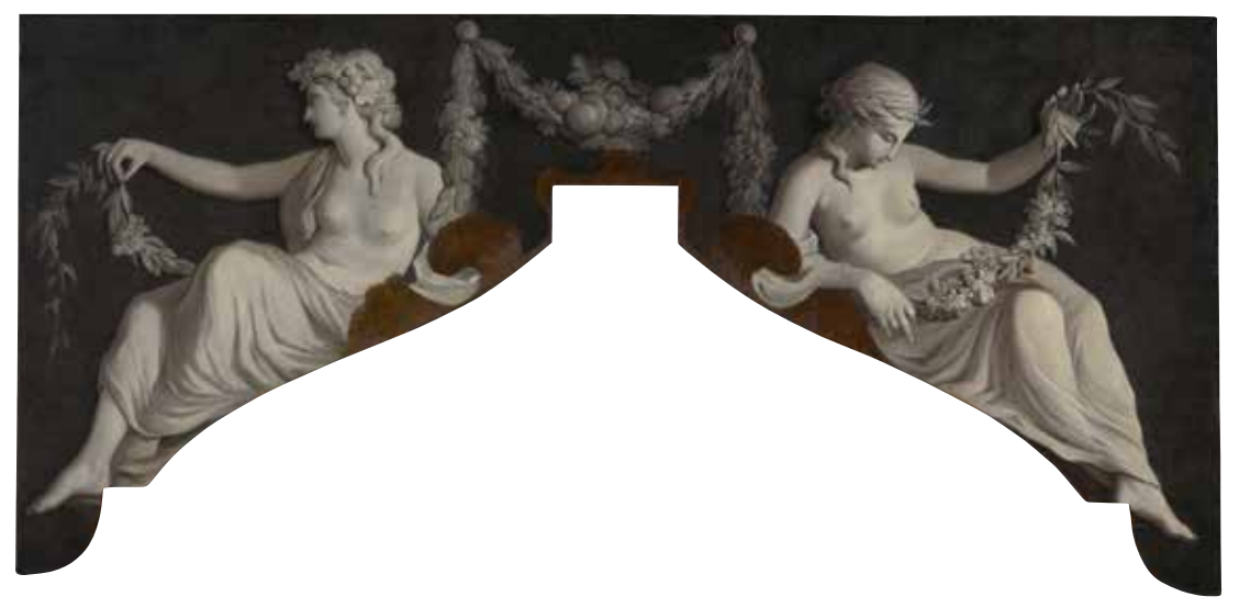
Figs. 10a, b JURRIAAN ANDRIESSEN, details of design series 1 and 11 for the Beuning Room, after 1781. Amsterdam, Rijksmuseum, inv. nos. RP-T-00-1031 and 1121.