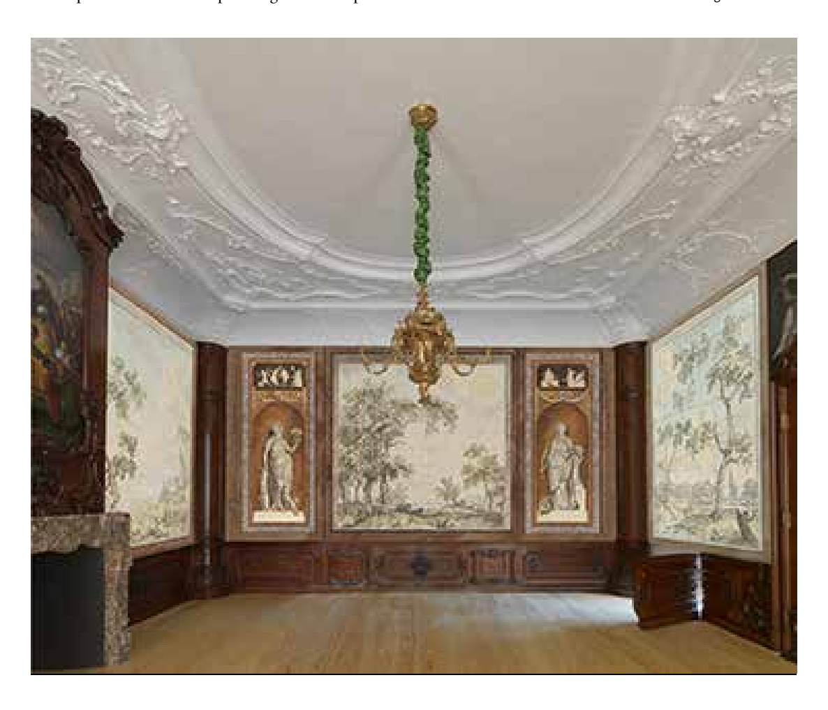
Fig. 17 Digital reconstruction of the missing borders of Bacchante and Peace and design sketches in the Beuning Room.

The digital reconstruction of the paintings in the room shows that everything fits well, with the exception of the position of the concealed door in the