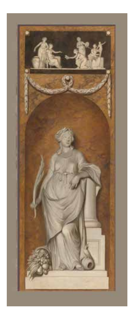
Figs. 19a, b Digital reconstructions with strip-lining in a neutral tone.