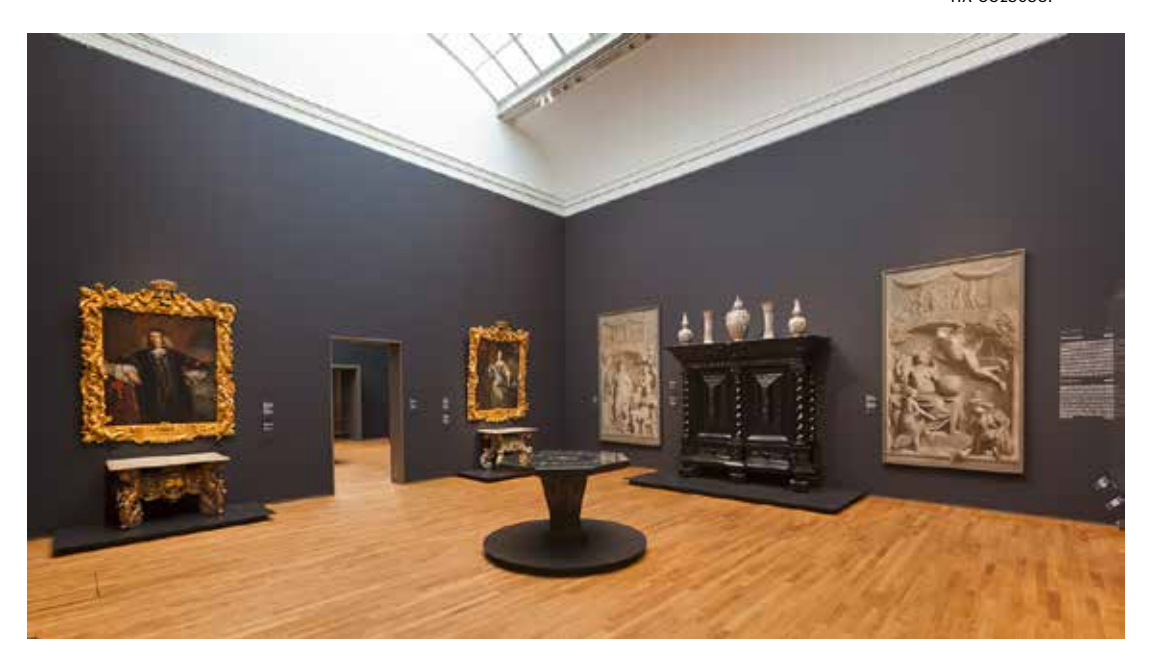
Fig. 5 Display of Allegory of Riches (fig. 3), current display showing Sciences and Fame.