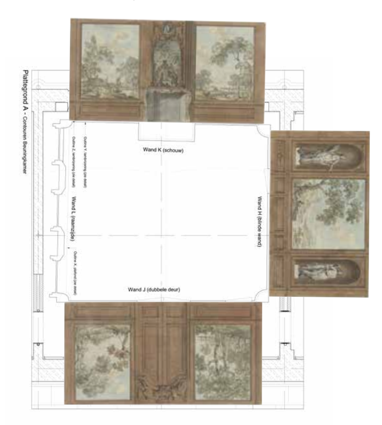
Fig. 9 JURRIAAN ANDRIESSEN, design sketches for the Beuning Room superimposed on the floor plan, after 1781. Reconstructed by the author with maps by Van Hoogevest Architecten. Above: design I. Below: design II. Also see figs. 3-7 on pp. 46-49.