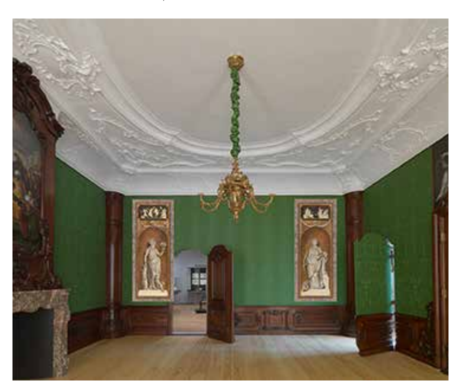
Fig. 20 Digital reconstructions with strip-lining in imitation marble.

(fig. 19). Another option is not to tone the strip-lining in a neutral way, but to make a physical reconstruction of the marbling, on the basis of the fragments of original paint. The actual rouge royal marble of the mantel would also provide guidance. A digital reconstruction of this last option in Photoshop, superimposed on to the current wall covering of the Beuning Room indicates how this would look (fig. 20). In the actual room, it might also be an option to fill the empty space in the middle and the missing borders of the allegorical figures with a digital reconstruction by means of augmented reality (real time digital information: while visitors hold a touch screen tablet in front of the wall, an image of Andriessen's design sketch would be superimposed). The missing wooden framework separating the two female allegories and the landscape wall hanging could also be reconstructed physically or digitally. In short, there is a whole range of possibilities for presentation.