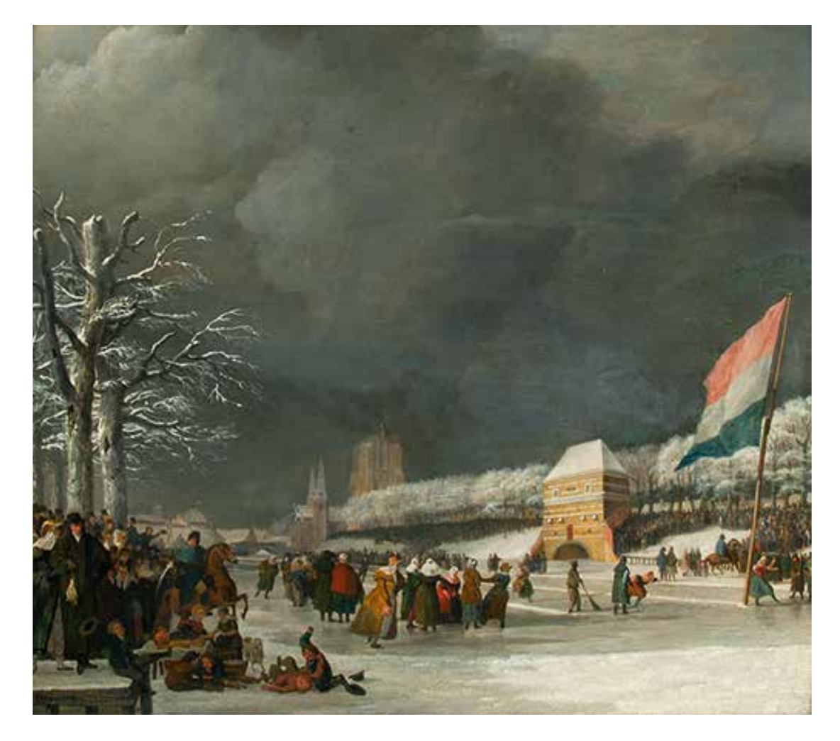
Fig. 2 NICOLAAS BAUR, View of the Westersingel in Leeuwarden, in the Winter: Speed Skating for Women, 1809. Oil on panel, 39.7 x 44.2 cm. Leeuwarden, Fries Museum, The Frisian Society for History and Culture Collection, inv. no. S07596.

race for women before then. The first documented race for female skaters was held on Leeuwarden's Stadsgracht on 1 and 2 February 1805 and no fewer than 130 Frisian girls and women, married and unmarried, ranging in age from fourteen to fifty-one took part. Attracting unprecedented public interest – according to reports there were between 10,000 and 12,000 spectators - the race was won by twenty-year-old Trijntje Pieters – later named in full as Trijntje Pieters Westra – a farmer's daughter from Poppingawier who beat sixteen-year-old Janke Wybes from Damwoude. The list of competitors reveals that she had first knocked out a certain Aukje Gerrits, aged twenty,