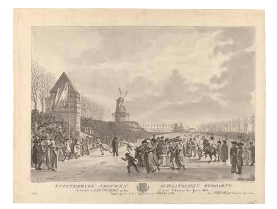
Fig. 4 JACOB ERNST MARCUS AFTER A DRAWING BY ALDERT JACOB VAN DER POORT, Skating Competition for Women in Leeuwarden, 1805, 1805. Etching, 451 x 619 mm. Amsterdam, Rijksmuseum, inv. no. RP-P-0B-67.850.

Fig. 5 JACOB ERNST MARCUS AFTER A DRAWING BY ALDERT JACOB VAN DER POORT, The Women's Skating Competition on the Stadsgracht in Leeuwarden, 1-2 February 1805, 1805. Etching, grey wash, 477 x 640 mm. Amsterdam, Rijksmuseum, inv. no. rp-p-ob-67.851.