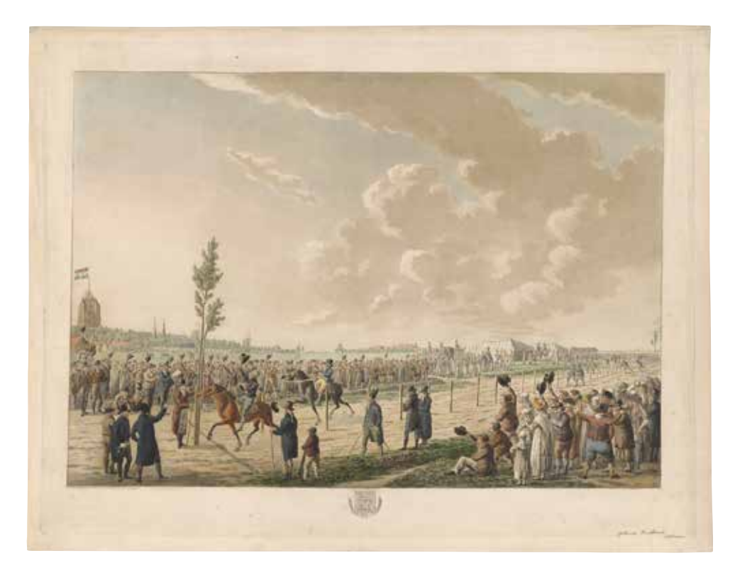
Fig. 20 JAN ANTHONIE LANGENDIJK DZN, Skating Competition in Leeuwarden, 2 September 1808, 1808. Etching, aquatint and colour washes, 459 x 612 mm. Amsterdam, Rijksmuseum, inv. no. RP-P-0B-67.814.

year Baur won a cash prize of three thousand guilders at the Exhibition of Living Artists staged there.<sup>129</sup>