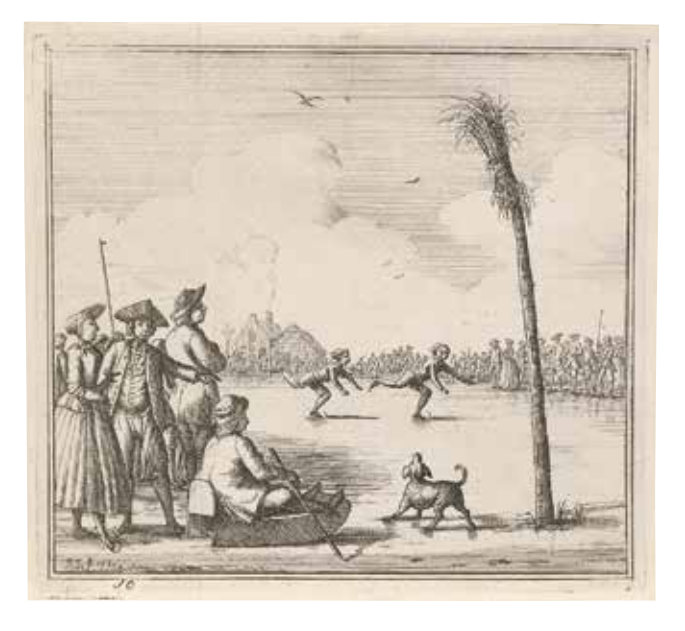
Fig. 7 RIENK JELGERHUIS, A Skating Race, from the series The Winter, 1765. Etching and engraving, 143 x 156 mm. Amsterdam, Rijksmuseum, inv. no. RP-P-1882-A-6035.

from Grijpskerk used in the Opregte Groninger Courant on 11 January 1763 - derived from the usual announcements for trotting races at this time, with the name of the event, the date, place and the prizes to be won - became the standard template until well into the nineteenth century: 'THE HON. JOHANNES TOMAS, Landlord of the Pylaars in Grypskerk is minded, on the coming Wednesday the 12th of January 1763 in the afternoon, to stage a race on skates; the fastest skater will receive a prize of a particularly fine silver knife and fork."4 The oldest known picture of a Frisian short-distance race dates from precisely this time. In 1765 the Leeuwarden printmaker Rienk Jelgerhuis made an etching and engraving which showed two speed skaters on a canal amidst a huge crowd (fig. 7). This print was included that year in the second edition of the Leeuwarden-born poet Boelardus Augustinus van Boelens's De winter in drie zangen , an ode to winter in Friesland, which was published for the first time in 1749.15