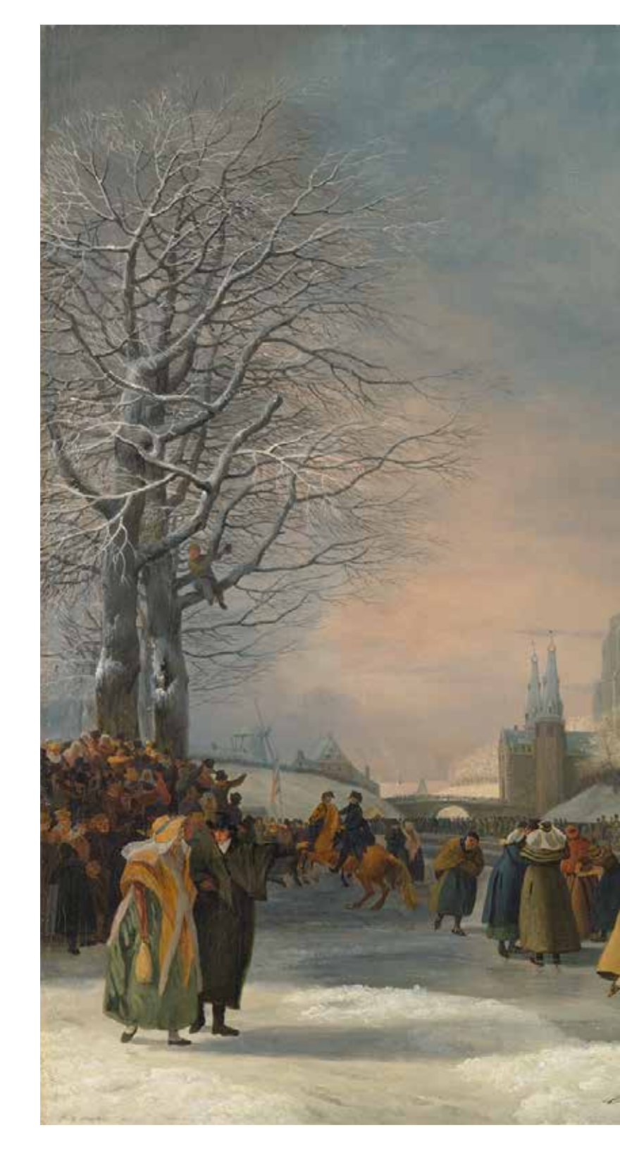
Fig. ı NICOLAAS BAUR, The Women's Skating Competition on the Stadsgracht in Leeuwarden, 21 January 1809, 1810. Oil on canvas, 59.7 x 74.9 cm. Amsterdam, Rijksmuseum, inv. no. sк-а-5020; gift of Willem Jan Hacquebord and Houkje Anna Brandsma, 2013.