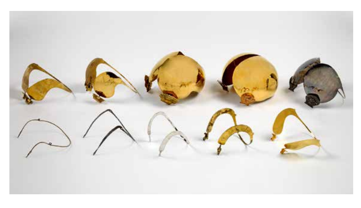
Fig. 16 The changing designs of Frisian cap brooches from the sixteenth to the late nineteenth century (from left to right, from bottom to top). In the early nineteenth century the cap brooch enjoyed a spectacular flowering in Friesland, evolving into what was essentially a gold helmet. Leeuwarden, Fries Museum Collection.

she skated the first hundred metres in 10.09 seconds.<sup>80</sup> For a distance of 149 metres this would give a time of approximately 15.03 seconds – and that on the mirror-smooth artificial ice of a covered high altitude track, with clap skates and in an aerodynamic skating suit.