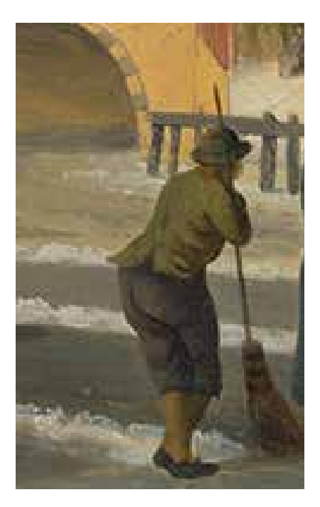
Fig. 11 Detail of the track sweeper (fig. 1).

It was not until the second half of the nineteenth century, after the appearance of skating clubs, that the length of a skating track was fixed at 160 metres for men and 140 metres for women. These distances are still used today.<sup>52</sup>