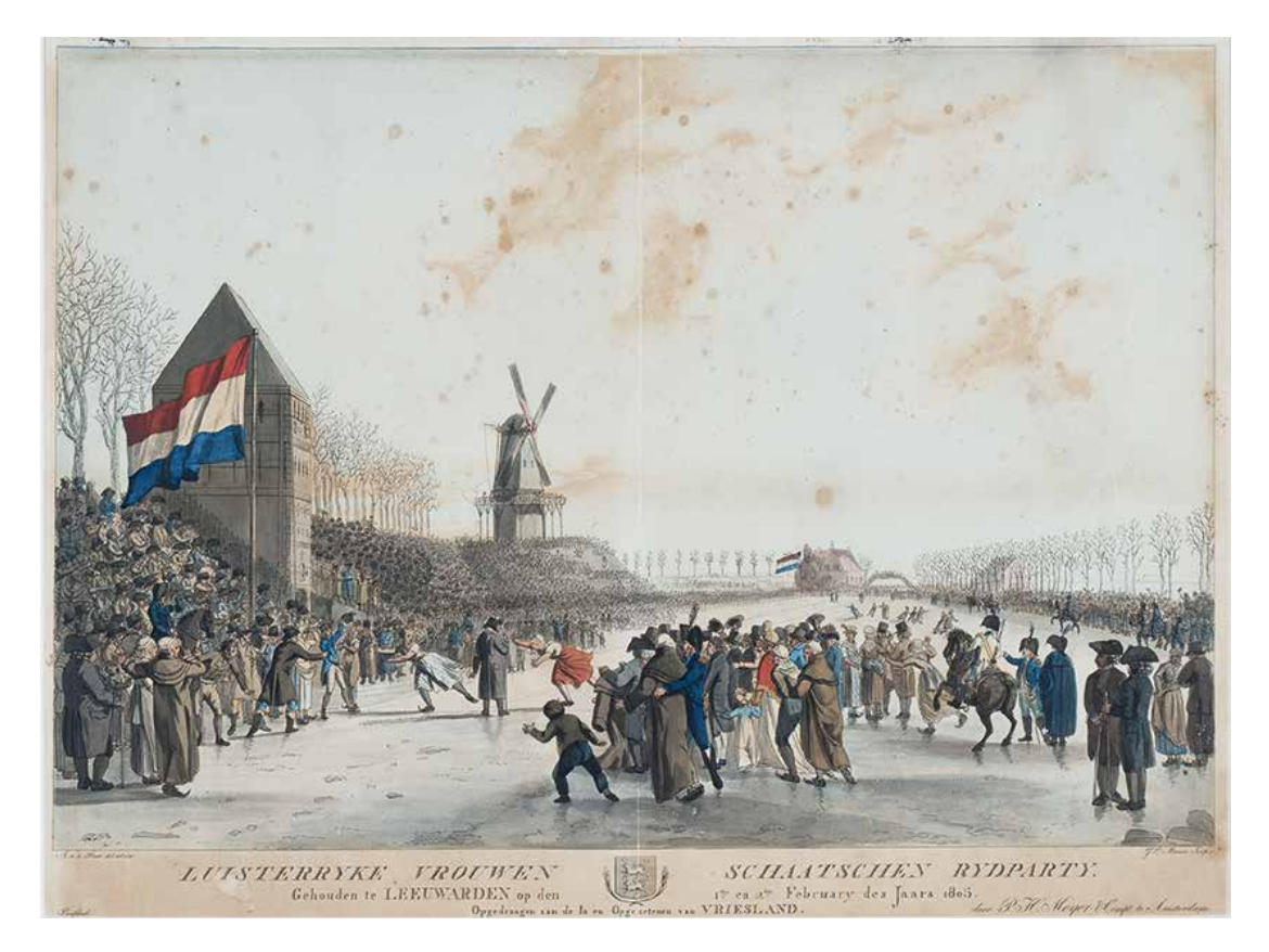
Fig. 6 JACOB ERNST MARCUS AFTER A DRAWING BY ALBERT JACOB VAN DER POORT, The Women's Skating Competition on the Stadsgracht in Leeuwarden, 1-2 February 1805, 1805. Etching and aquatint, 394 x 569 mm, Leeuwarden, Fries Museum Collection, inv. no. ртаоб3с-ооб.

women. While figure-skating was all the rage in Holland, speed skating was more popular in Friesland and Groningen, and on occasion women also took part in skating races over longer distances in small groups. For example we know of a race to Groningen skated by two women in 1801 in which they covered thirty miles in two hours." It is remarkable that over the course of the eighteenth century the elite, primarily in the west of the country, had increasingly distanced themselves from skating. 'Nowadays our people usually look upon skating as low entertainment for the common man', said the Leiden-born naturalist and writer Johannes Le Francq van Berkhey in 1773.12 This did not apply to the northern provinces, where skating remained popular with the majority of the population.