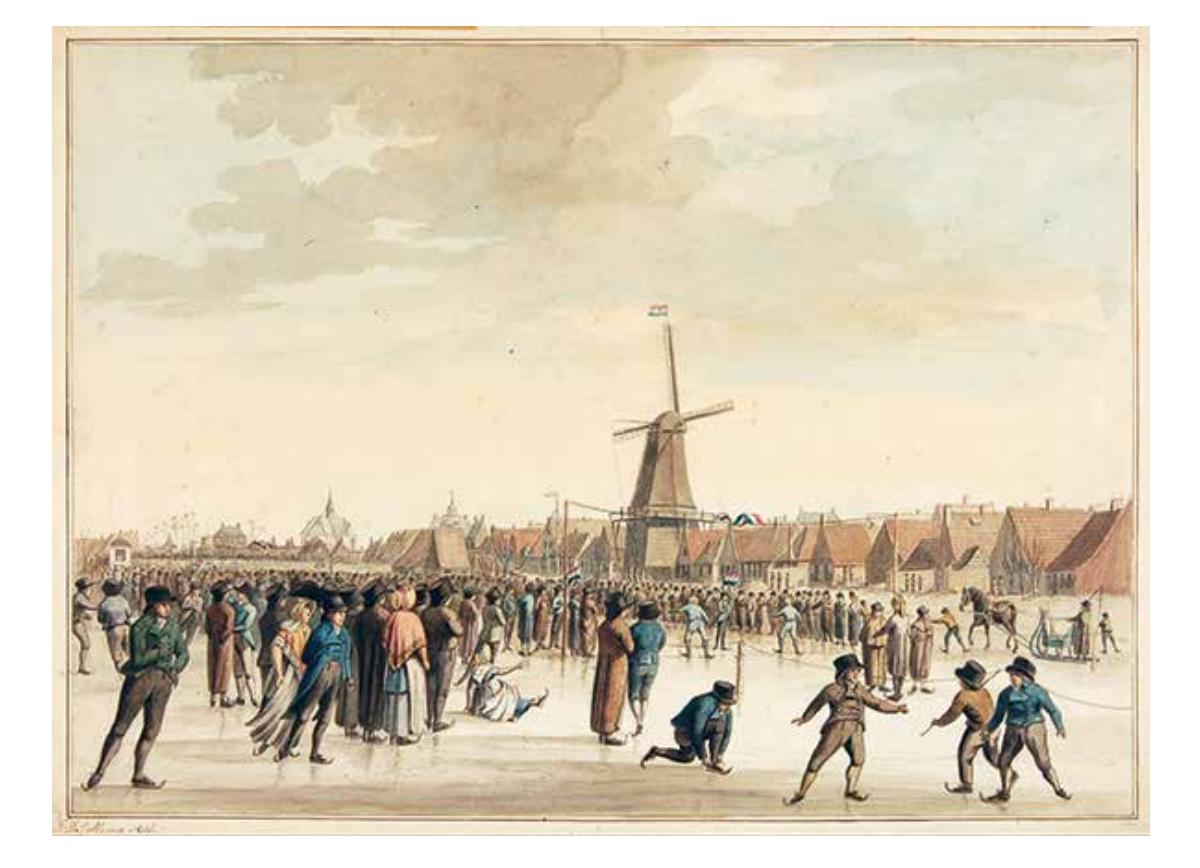
Fig. 13 DIRK PIEBES SJOLLEMA, Racing on Skates at Heerenveen, g January 1811, 1811. Watercolour, 324 X 449 mm. Leeuwarden, Fries Museum Collection, inv. no. PTA498-022.

A crowd of such magnitude needed close supervision. Some weeks before, in the Groningen village of Zuidbroek, it had become only too clear just how difficult it could be to restrain the crowd. The organizers would have been keen to prevent such scenes in Leeuwarden. In the provincial capital they had the advantage of being able to call on the soldiers garrisoned in the city, who supervised the event, kept the crowd in check, chased young tearaways off the ice and guaranteed the competitors' safety.66 It was specifically pointed out that it had even been possible to deploy the cavalry on the ice for the event in 1805,67 so this effective resource was used again in 1800. Baur refers to this exclusive aspect by showing two cavalrymen on the ice on the left, keeping the spectators at a distance; the nearer trooper