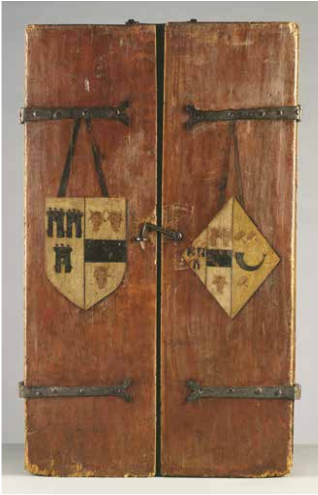
Fig. 9 Casket belonging to the crib in the Musée de Cluny in Paris (fig. 8). Oak?, 69 x 41 x 21.5 cm.