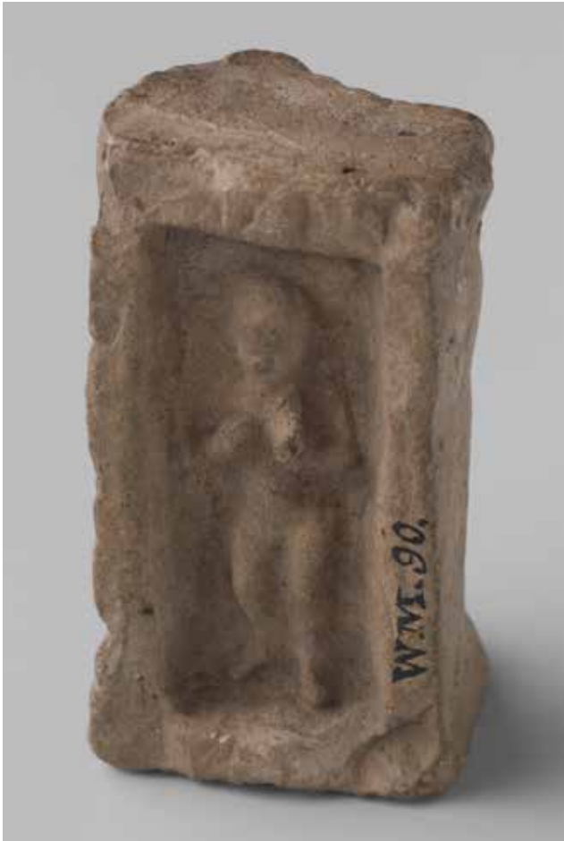
Fig. 12 ANONYMOUS, Crib with Christ Child , c. 1400-1600. Pipe clay, 4.6 x 2.3 x 2.1 cm. Amsterdam, Rijksmuseum, inv. no. BK-NM-11289.

associated their cribs with metaphors like these and used them in this way. A profound spirituality like this was probably confined chiefly to convents and beguines. In her book, the anonymous author of the Evangelische Peerle describes 'How God in three ways is born in man from these three unions... likewise this Holy trinity is threefold in people, but in essence one'. 48 The first way is the 'godlijcke geboorte inden gheest' (spiritual birth in the soul), which people experience during Christmas night. It is above all a visual event, where believers are witnesses to the physical, outward birth of the Christ Child in Bethlehem. During 'Die tweede gheboorte inder sielen' (the second birth in the soul) the endeav-