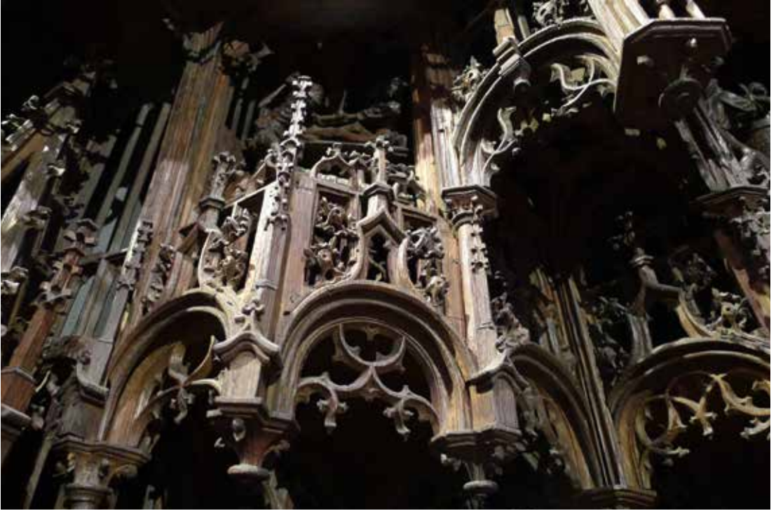
Fig. 4 Detail of the arch and bell shape of the St George Altar (fig. 3).