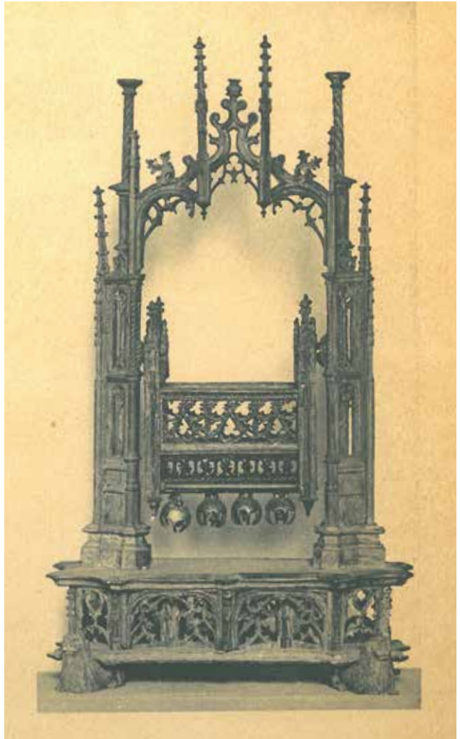
Fig. 13 Photograph of the Christmas crib from Arthur Sambon's collection, from the Catalogue des objets d'art ... , sale cat. Paris (Galerie Georges Petit), 25-28 May 1914, no. 389.

After careful study of the crib in the sale catalogue it was found that that it was not exactly the same as the example in Musée de Cluny (fig. 13). In the 1914 photograph it is clear that the moving part – the crib – is that of the Amsterdam cradle: the tracery consists of serried, teardrop-shaped trefoils topped with fleurons, whereas the tracery of the crib in Musée de Cluny has teardrop-shaped quatrefoils, which include little roses, protruding alternately from the top to the bottom (figs. 14, 15). The base and the portal