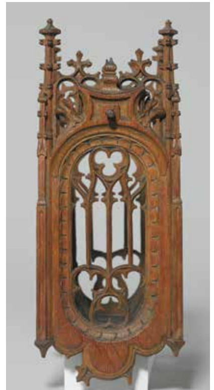
Fig. 5 Detail of the head and foot ends of the Rijksmuseum crib (fig. 1).

compact form. There is also a clear affinity with the St George Altarpiece in the shape and division of the pilasters and pinnacles, and in the fact that both the crib and the large altarpiece were never polychromed. 13