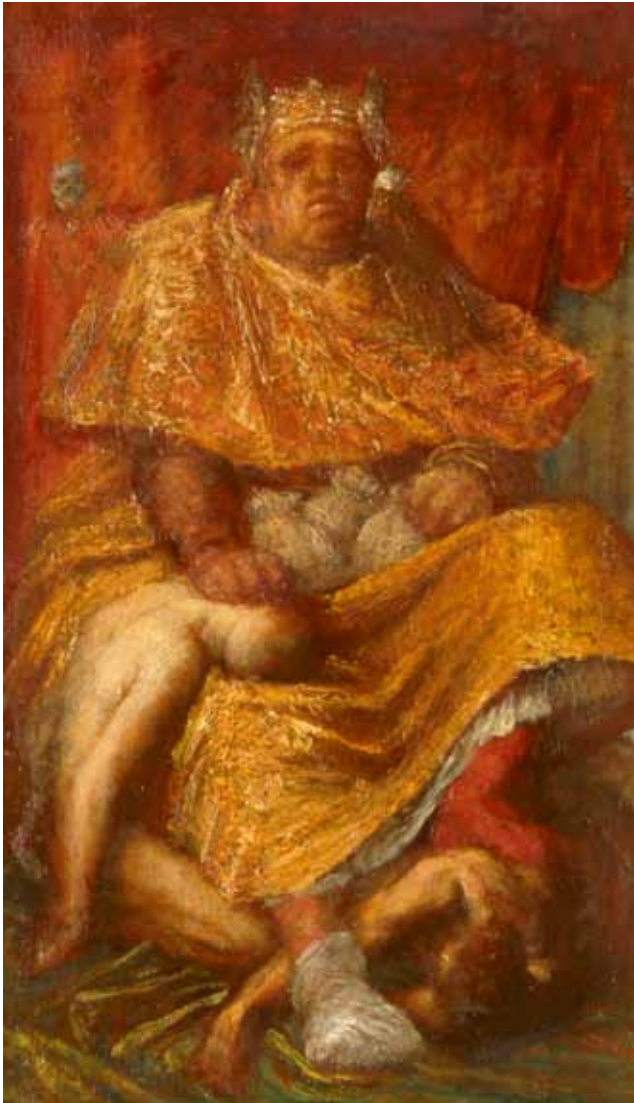
Fig. 2 GEORGE FREDERIC WATTS, Mammon , c. 1884-85. Oil on canvas, 182.9 x 106 cm. Compton, Watts Gallery, inv. no. COMWG.49.

moneybags on his lap and claws on his feet. The ass's ears are an unmistakable reference to Thomas Carlyle's Past and Present (1843), an indictment of the industrial society of nineteenth-century Britain. 12 In it Carlyle speaks of 'Midas-eared Mammonism', an allusion to the avarice and stupidity of King Midas. 13 A metropolis looming up behind the Golden Calf and a Tower of Babel complete the scene.