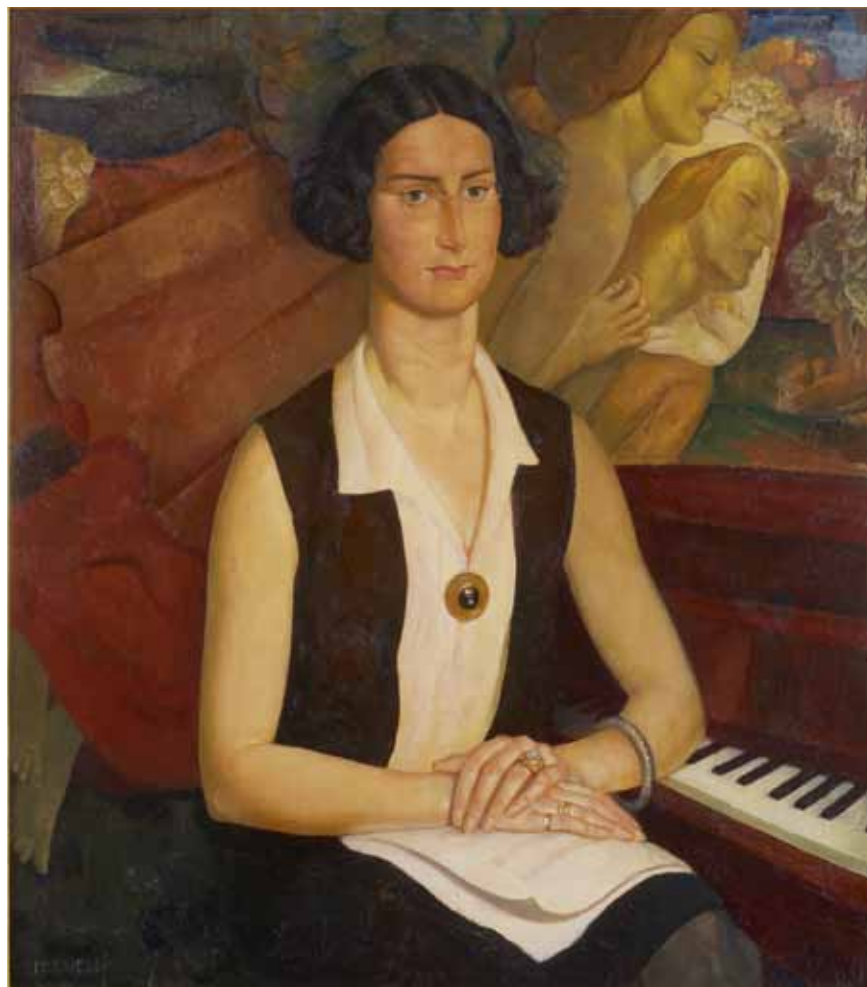
Fig. 5 HENRI VAN DE VELDE, Elizabeth and the Muses , 1930. Oil on canvas, 105 x 115 cm. Arnhem, Museum voor Moderne Kunst Arnhem, inv. no. GM 2011.112.